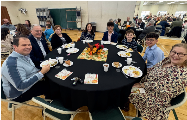
Annual Thanksgiving Lunch

We had no shortage of opportunities to gather together over these last few months. From age-graded activities like the youth group's Disciple Now event to churchwide events like our annual Thanksgiving Lunch, we welcomed one another into community and fellowship. We're grateful for the ways in which our church family participated, served, ministered, and came alongside one another to encourage and spur one another on.