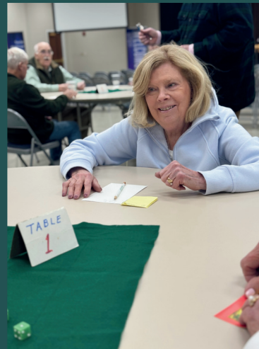
LOGOS Bunco & Chili