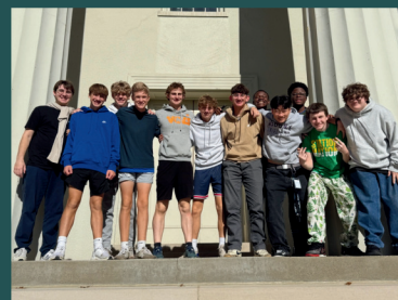
Youth Disciple Now