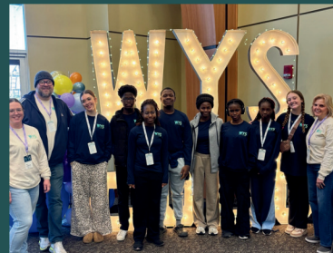
Winter Youth Summit