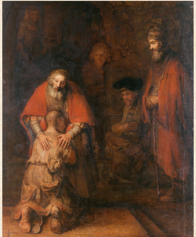
The Return of the Prodigal Son Rembrandt, 1663-1669

This Lenten Mission will be kicked off on the weekend of March 21-22 at all the Masses throughout the parish family, and all are invited to attend these evenings of prayer, reflection and renewal.