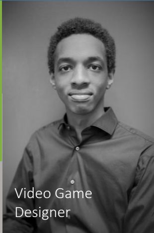
Video Game Designer