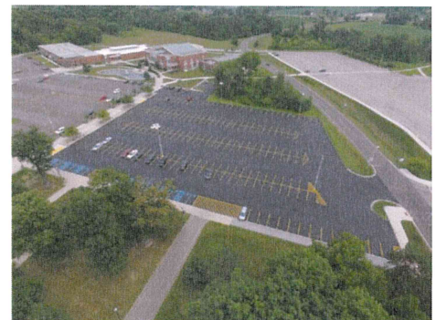
James Biddle Dr. & Parking Lot Improvements