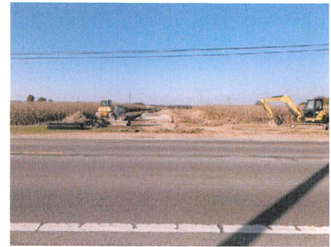
US 224 / OG Road Connector Street

Sitecomp, TruCAD, Word, Excel, Total Station, Data Collector, Transit & Leveling Equipment