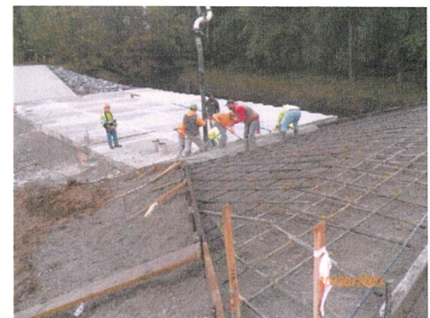
Ottawa Diversion Channel