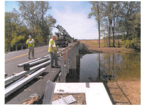
PUT-OLD S.R. 12-16.40

Bockrath & Associates Engineering and Surveying, LLC