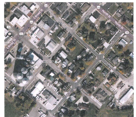
5th St. & Plum St. Reconstruction