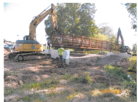
Plum Creek Nature Trail Pedestrian Bridge