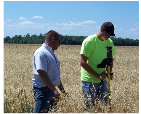
Private Land Survey

Bockrath & Associates Engineering and Surveying, LLC