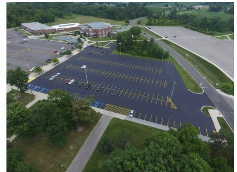
James Biddle Dr. & Parking Lot Improvements