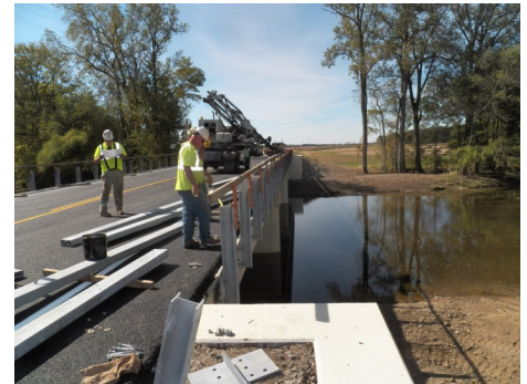
PUT-OLD S.R. 12-16.40