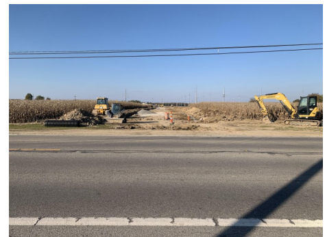
US 224 / OG Road Connector Street