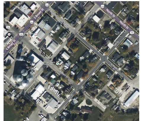
5th St. & Plum St. Reconstruction