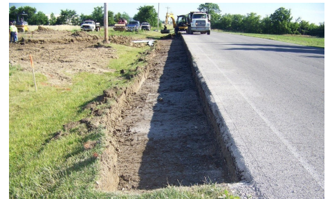
Road Widening Project