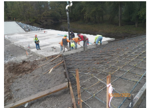
Ottawa Diversion Channel