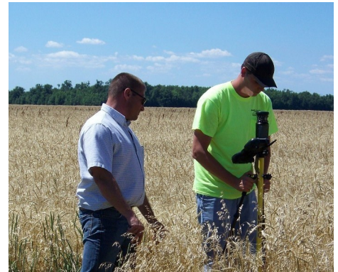
Private Land Survey