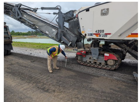
Procter and Gamble Roundabout at Thayer Road