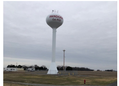
Pandora Water Tower