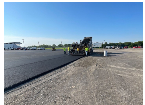
Putnam County Fairgrounds Parking Lot