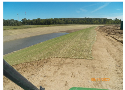
Ottawa Diversion Channel