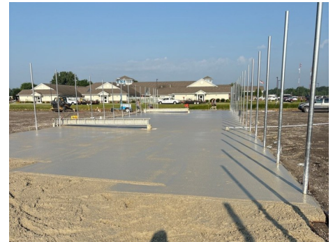
Ottawa Elementary Tennis Courts