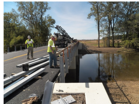
PUT-OLD S.R. 12-16.40