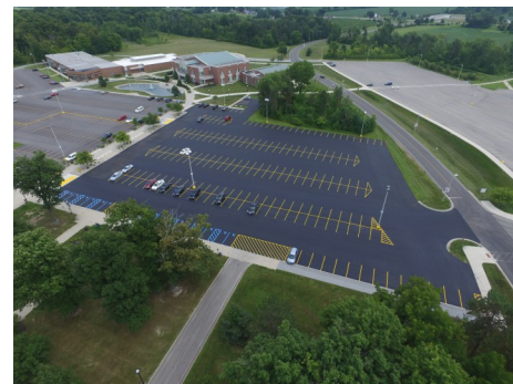
James Biddle Dr. & Parking Lot Improvements