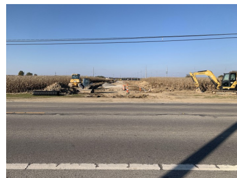
US 224 / OG Road Connector Street