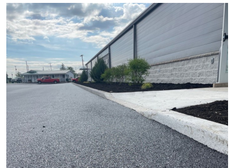
Putnam County Fairgrounds