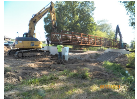
Plum Creek Nature Trail Pedestrian Bridge