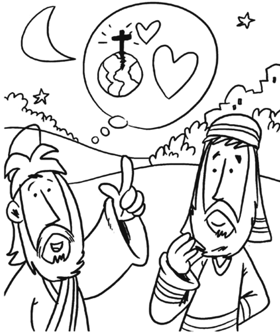
The Most Holy Trinity • John 3:16-18

Read the Gospel of the week and color the image.