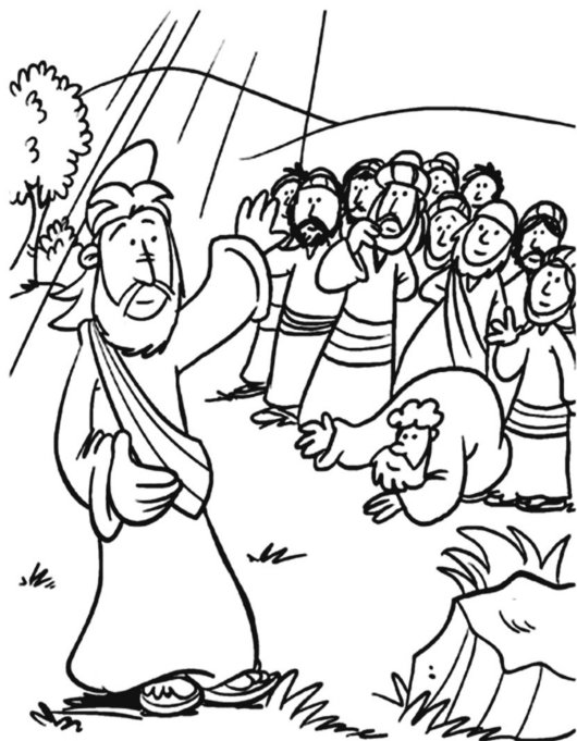
The Ascension of the Lord • Matthew 28:16-20

Read the Gospel of the week and color the image.