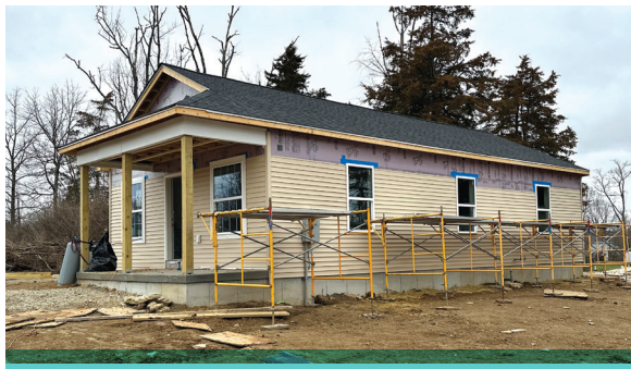
One of two new Oxford Habitat for Humanity homes