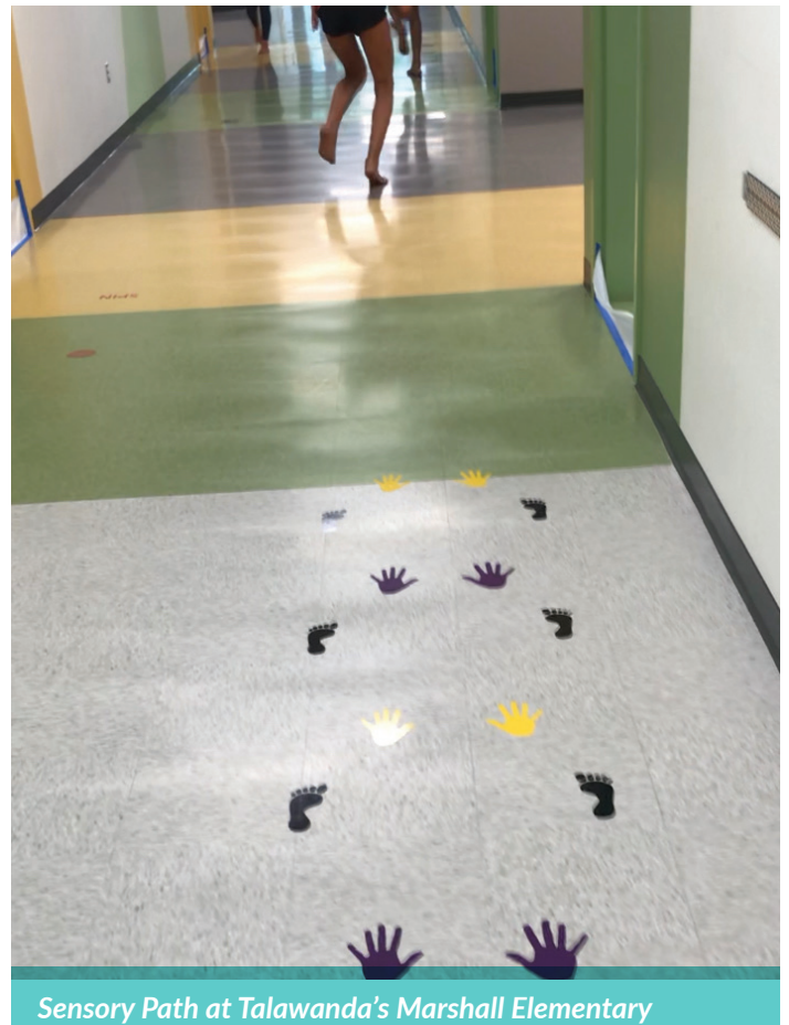
Sensory Path at Talawanda's Marshall Elementary

Nominations for the Harry and Virginia Teckman Award may be made by anyone in greater Oxford and are accepted throughout the year at oxfordfdn.org . The deadline is each January 31st with the award given each Spring.