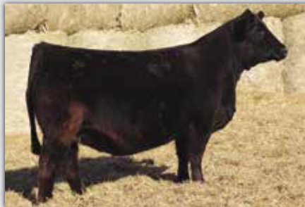
W/C Miss Werning 990G

TNGL Grand Fortune Z467 x CLRWTR Sazerac W94B