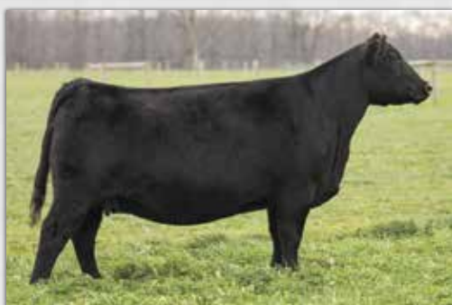
FSC Ericas Lutton - Dam of Lot 37

Lots 36: A moderate framed cool looking bull by Sazerac 251D. J161 was Reserve Champion Bull as a calf at the Ohio State Fair. Great Scrotal, 89 lb birth weight and good disposition. Now you can make a bunch of Sazeracs in one breeding season.