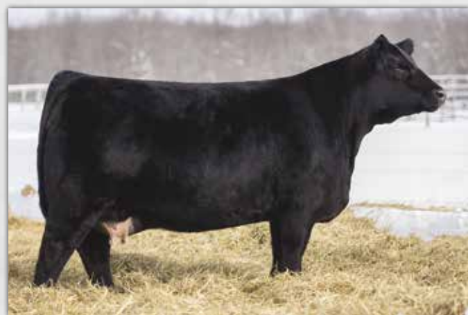
TNGL A Gemstone A527 - Dam of Lots 1 to 1D

Lots 1 & 1A: Top of the food chain here. These two Bet On Red's will give some serious contention wherever they land. I'm not sure how to differentiate between the two except one is a January and one is an April. Sleek modern and enough gas to go the distance!