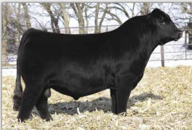
SO Remedy 7F - Sire of Lot 9