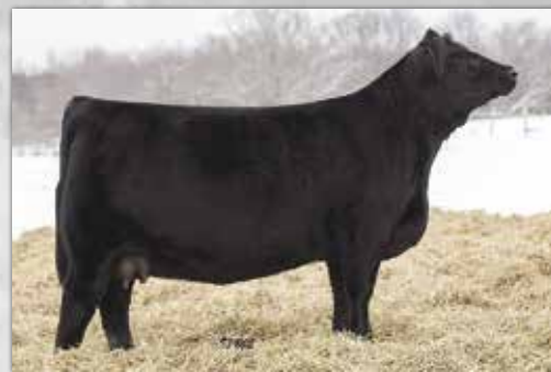
CAJS Sweet Emotion 42Z - Dam of Lot 3A, Granddam of Lot 3

Lot 3A: Sweet Emotion has not missed a step producing AI bulls and big time donors for a $90,000 valuation. We just started using some Style and I get it now. Soft and subtle. Study this one!