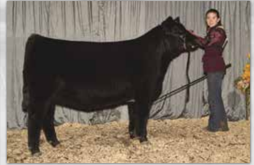
H20S/FSCI Miss Style G10 - Dam of Lot 29

Lots 29: We sold J149's dam to Delaney Chester and worked out a flush. Typical Fort Knox middle on a little bigger frame. Honey x Styles' are getting it done in the show ring and in the pasture. Bred up to Epic for early Success!