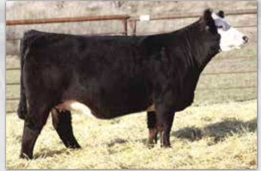
W/C RJ 8453 4016B - Dam of Lots 16 & 16A