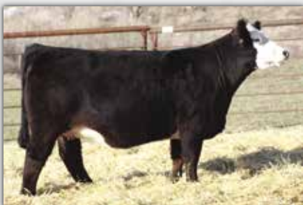
W/C RJ 8453 4016B "Grace"

W/C Bullseye 3046A x KS Miss Sequoia Y770