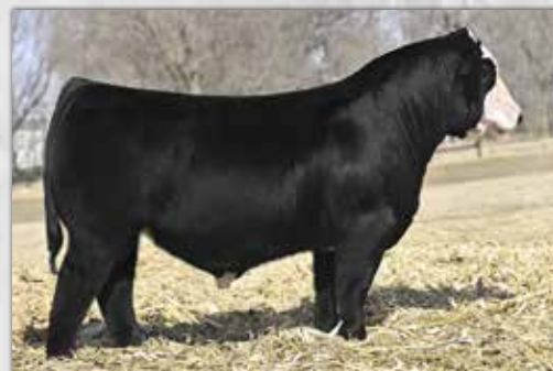
W/C Bank On It 273H Full Brother to Lots 22 & 22A

Lots 22 & 22A: Genetics! Cow families! Full sib to W/C Bank On It! What's Bankroll semen cost? $200-$400 a straw and $800+ for sexed? A black baldy or a solid red, take your pick or buy them both.