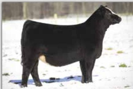
Sandeen Loaded Lady 2625

Conley GCC Shocker C19 x Sandeen Loaded Lady 6025 Owned with Sandeen Genetics