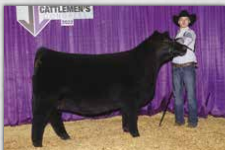
CCS/JS Summer 31H

HPF Quantum Leap Z952 x Sandeen Donna 8302 Owned with Sandeen Genetics