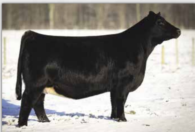
FSCI Ms Gemstone F028

Full Sister the Dam of Lot 1C, FSCI MS Gemstone F028