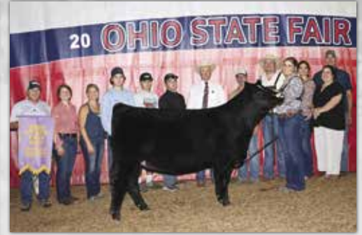
FSCI Ms Emotion K713 Maternal Sister to Lots 14 & 14A Reserve Champion Simmental Female 2023 Ohio State Fair

Lot 14A: Sweet emotion still brings home the goods. This goggle-eyed massive female will raise good ones for a long time. Stacking up some great genetics here.