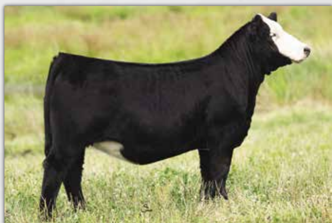
J072 - Full Sister to Lots 15 & 15A