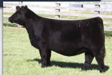
Sandeen Donna 1142

W/C Relentless 32C x Sandeen Donna 8405 Owned with Sandeen Genetics