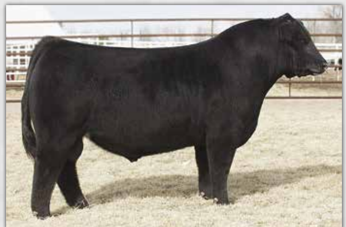
BNWZ Data Bank 1311C - Service Sire of Lot 18

Vet called safe to BNWZ DATA BANK 1311C due approx. 1/8/2