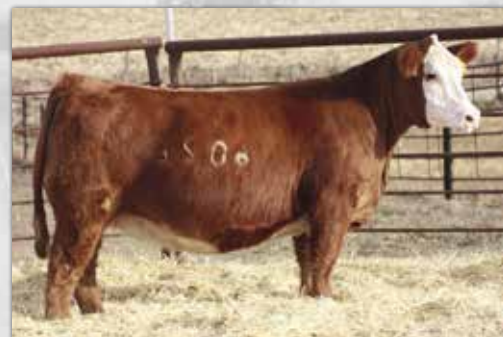
W/C Miss Werning 6026D - Dam of Lot 9A

Lot 9A: We were asked for opens with some color. I think this one fits the bill. Pandemic semen is $500 a unit. 6026D is a beast of a cow. This one is green as they come and has only been in the show barn for a minute. Needs more work on the halter. Has the pieces, just needs time.