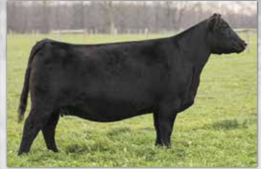
FSC Ericas Lutton - Granddam of Lot 7

Lot 7: A third generation purebred Angus from Erica. Taylor Poff showed L311's dam with great success. These Gateway Follow Me's are tearing it up on the tan bark. This one needs to find a show barn and start collecting residuals.