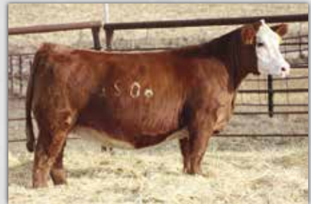
W/C Miss Werning 6026D

Rubys Turnpike 771E x W/C Miss Werning 6346D