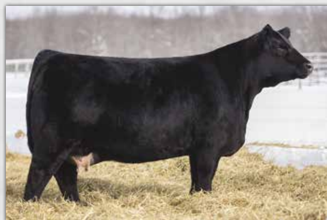
TNGL A Gemstone A527 - Dam of Lots 1 to 1D