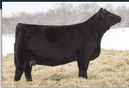
CAJS Sweet Emotion 42Z

JF Milestone 999W x Silverstone LPC Miss Awe