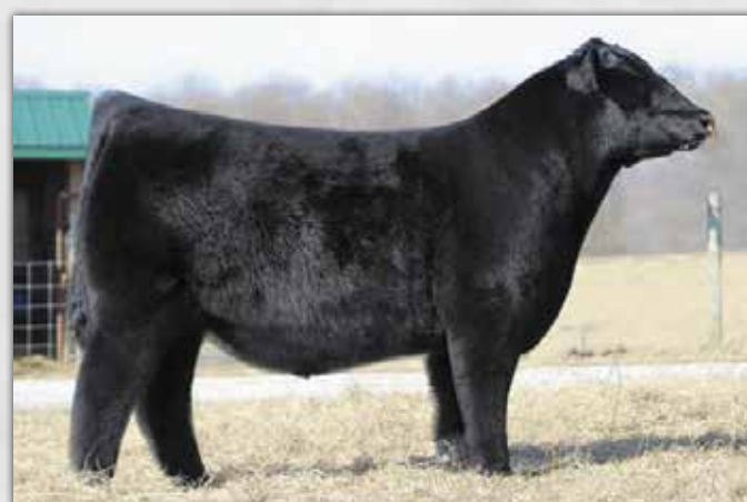
SCC SCH 24 Karat 838 - Sire of Lot 6

We purchased the original Ellie cow from Collison Angus quite some time ago. Flushed her to Meyer 734, couldn't keep them in stock. Then to Saugahatchee making Ellie 39Y3 who only made us half bloods until now. Why weren't we flushing these to Angus especially with the success Udells have had making national champions? We present the first Ellie Angus by 24 Karat. A blind man could find this one in a crowded subway. This one can stand some serious heat!