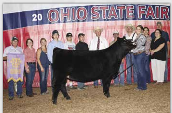
FSCI Ms Emotion K713 - Maternal Sister to Lot 3A Reserve Champion Simmental Female 2023 Ohio State Fair

One word "SPECIAL!" If you're in a big class be ready to keep moving up as they all fall out. Pretty ladies always get seated in the front row! L276 Donor Dam a Loaded Up x Sweet Emotion passed way too early. She's ready. The Lapp's bought an open for $11,000, Sandeen's bought a bred cow for $12,000, Andy Mast purchased an open for $8,000, ect. A Sweet Emotion x 20-20 has been running over the competition this summer. She was Third in her Division at the AJSA Eastern Regionals, Grand Champion OJSA Memorial Day Classic and Reserve Champion of the Ohio State Fair.