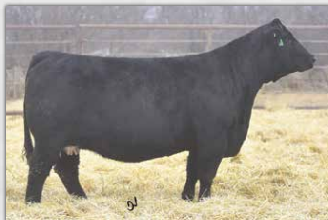
WS Miss Sugar C4 - Dam of Lot 32

Dam CLRS GRADE-A 875 A WS MISS SUGAR C4 WS ANISE A71