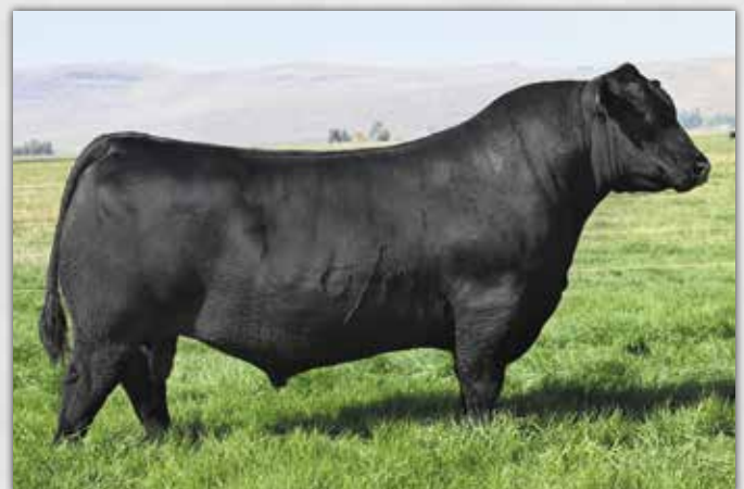
Coleman Ace 989 - Service Sire of Lot 21

Dam S A V 8180 Traveler 004 FSC Polleys 004 Coleman Polly 221