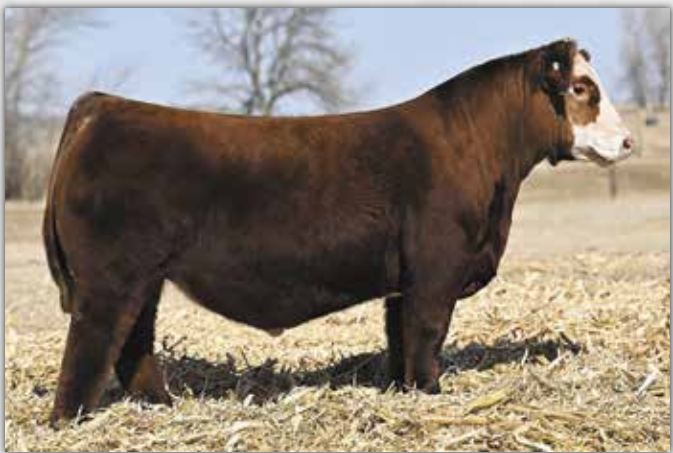
W/C Bet On Red 481H - Service Sire of Lot 11

Vet called safe to W/C BET ON RED 481H due approx. 1/29/24