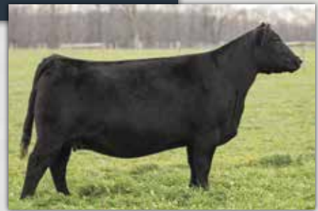
FSC Ericas Lutton

HTP/SVF Duracell T52 x JM Steel My Heart