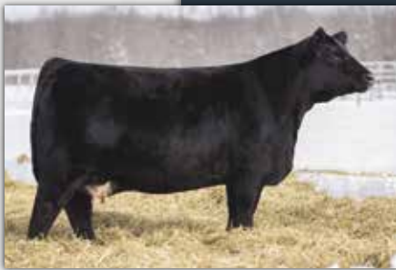
TNGL A Gemstone A527

JF Milestone 999W x Silverstone LPC Miss Awe