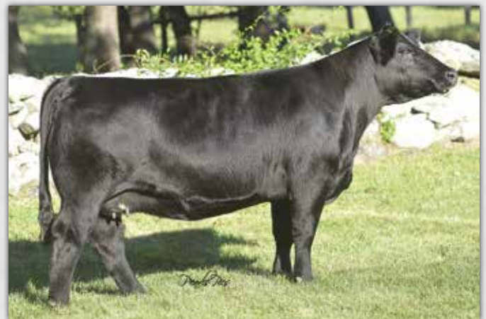
Ruby AJE Firefly Z227 - Dam of Lots 15 & 15A

Vet called safe to OMF EPIC E27 due approx. 1/8/24