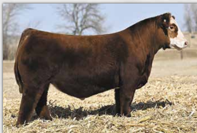
W/C Bet On Red 481H - Service Sire of Lot 11B

Vet called safe to W/C BET ON RED 481H due approx. 1/8/24