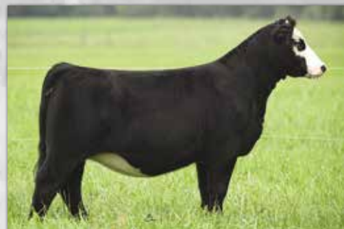
Maternal Sister to Lots 12 & 12A - Selling as Lot 1

Lot 12A: Gemstone's natural calf to our herd sire FSCI MR Anchor D677. In 2021 we sold a group of D677 breds that averaged $5,500. An easy doer with good numbers, bred to bet on red. This works see L300 and L280!