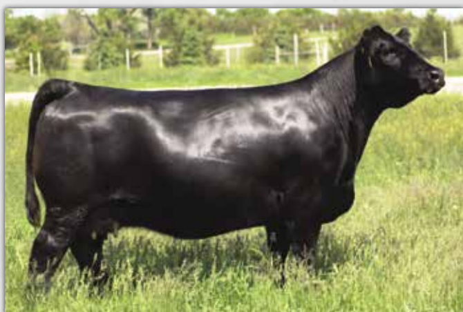
Miss Werning KP 8543U - Granddam of Lot 33