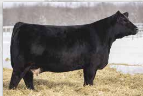
TNGL A Gemstone A527 - Dam of Lot 34

Lots 34: Stylish commercial bull with a little bigger frame. Huge nuted. This bull will cover some cows. 95 lb birthweight. Use on mature cows. Good disposition.