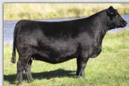
FSCI Ericas Right D166

W/C Fort Knox 609F x Ruby AJE Firefly Z227