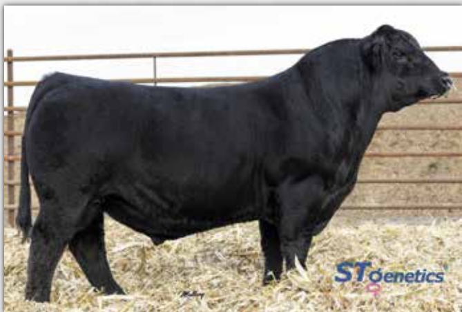
OMF Epic E27 - Service Sire of Lot 24