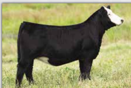
FSCI Ms Firefly J072

Gateway Follow Me F163 x WHF Summer 365C