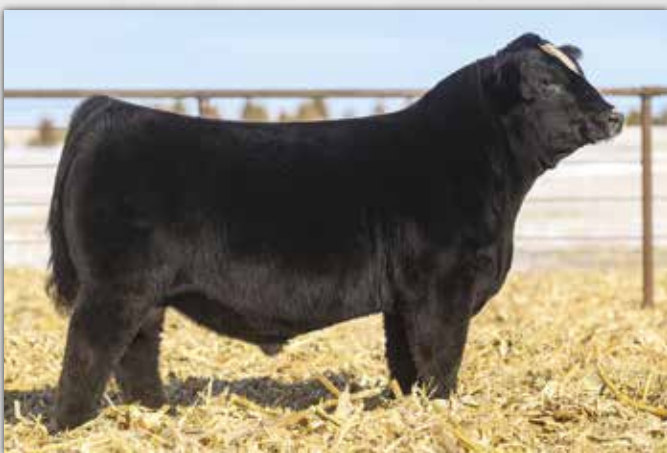
KCC1 Countertime 872H - Sire of Lot 5A