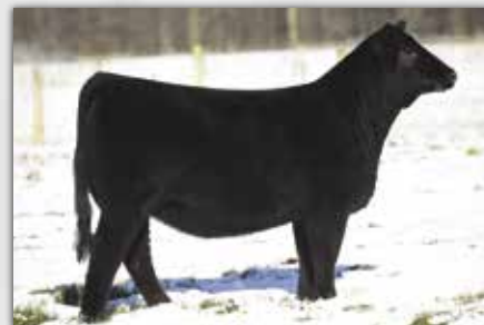
Sandeen Donna 2382

Conley GCC Shocker C19 x Sandeen Loaded Lady 6025 Owned with Sandeen Genetics