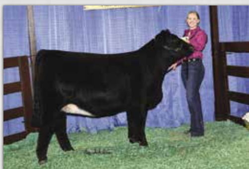
FSCI Built 2 Execute G049 - Dam of Lot 1E

Lot 1D: Can't go wrong with a Gemstone. This one's got a lot of future! She's only been in the show barn a couple weeks. A full sib won the Minnesota Beef Expo. There's a map on this one.