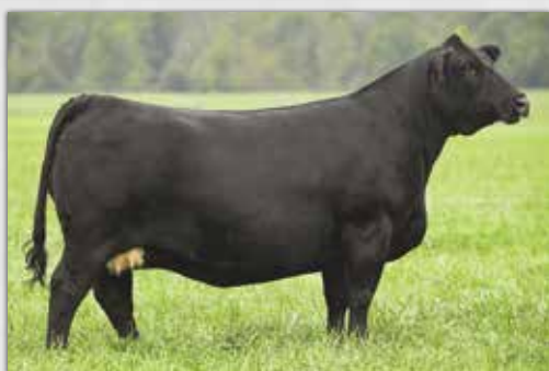
HPF Sazerac 251D - Dam of Lot 13

Lot 12A: Gemstone's natural calf to our herd sire FSCI MR Anchor D677. In 2021 we sold a group of D677 breds that averaged $5,500. An easy doer with good numbers, bred to bet on red. This works see L300 and L280!