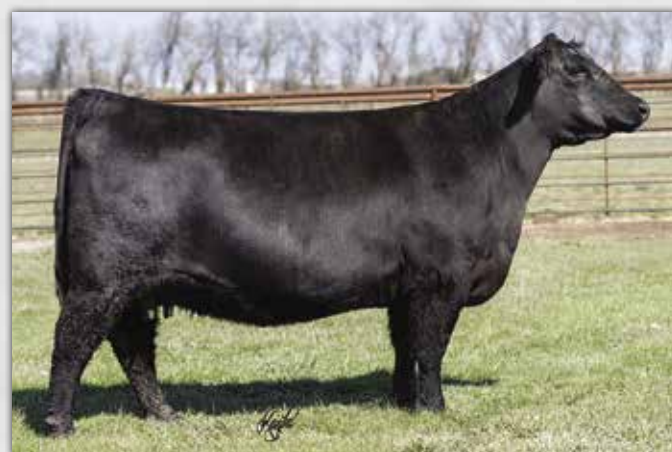
PVF Missie 3078 - 3/4 Sister to Lot 20