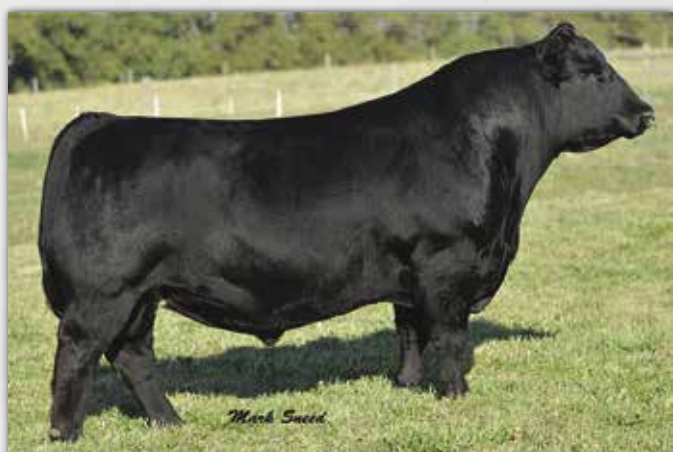
PVF Insight 0129 - Service Sire of Lot 20A