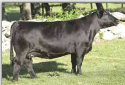
Ruby AJE Firefly Z227

Remington Lock N Load 54U x Miss Werning KP 8543U