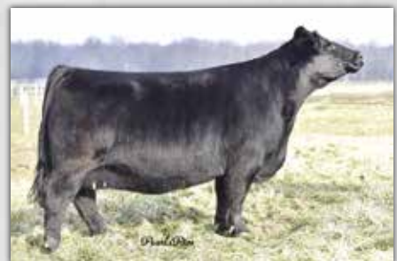
FSCI Neons Regard C505

Yardley High Regard W242 x LLSF Neon Rey