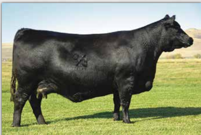
Coleman Donna 386 - Granddam of Lot 31