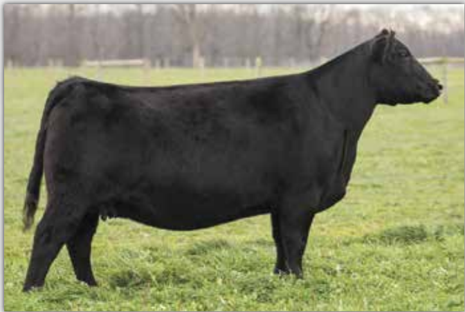
FSC Ericas Lutton - Granddam of Lot 11A