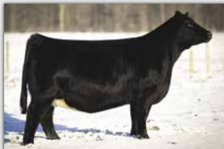
FSCI Ms Gemstone H049