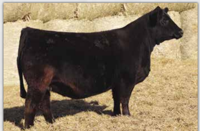
W/C Miss Werning 990G - Dam of Lots 5 & 5A

I don't think there is a person that has visited that doesn't walk up to this heifer and smile. Her rib and belly are off the charts. Turnpike gives you the numbers, SAM gives you the look. Something about Mary is burning up the tan bark. Get you some!