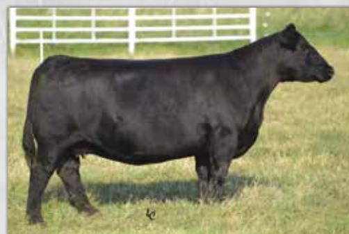
GW Miss GPRD 028X - Dam of Lots 23 & 23A

Lots 23 & 23A: These heifers are the result of embryos purchased going back to the maternal granddam to Fort Knox, GW Miss GPRD 028X. Pair that with the Broker bull we all know and love and now you have yourself two girls with some POP! Front pasture genetics that will put purple on your wall.