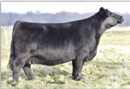
FSCI Neons Regard C505 - Dam of Lot 19

Lot 19: We have always liked our Neon Reys. Power. Mass. Bone. They don't give up anything. J142 is built for the long haul. This one is a little quicker than most but decent in a group. Nervous in close quarters.