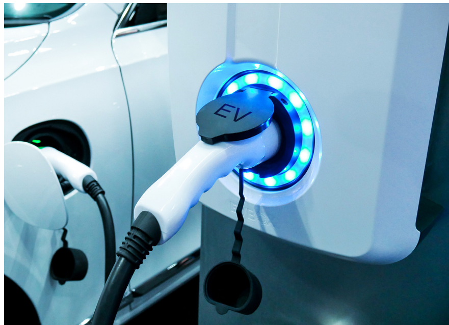
Some Top 50 members are adding EV chargers but others feel it is too early to commit

Many other Top 50 members have plans to redevelop existing sites, with most seeking to extend the amount of