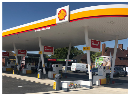
New entry: Award winner Hockenhull Garages

In addition to food-to-go, entrepreneurial retailers are also seeking to provide more services for customers to bring in additional revenue and generate extra footfall, with an increasing number of Post Offices and even laundrettes appearing on forecourts.