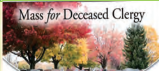
Mass for Deceased Clergy