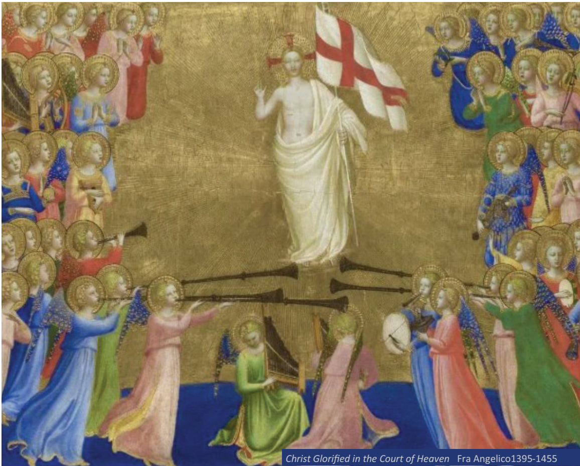
Christ Glorified in the Court of Heaven Fra Angelico 1395-1455