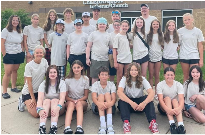
Middle School Mission Trip Crew

Our online service can be found on Facebook, YouTube or on our Website: CelebrationLutheranChurch.com