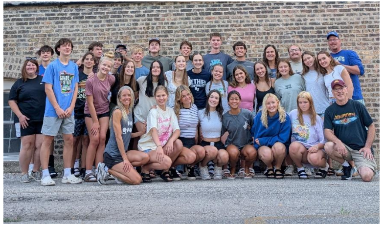
High School Mission Trip Crew