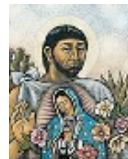
Row One - Blessed Pier Giorgio, St. Andre Bessette, St. Pope John Paul II, Mary Mother of God, St. Polycarp