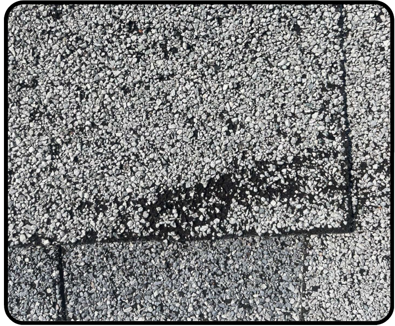
Granular loss in gutters