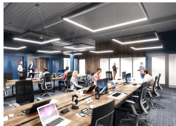
STRAND – 1,665 SF

The above images are conceptual renderings.