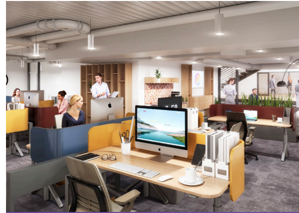
GENOME – 2,089 SF