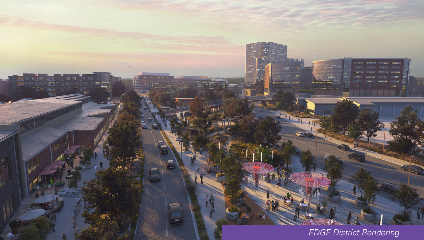
EDGE District Rendering