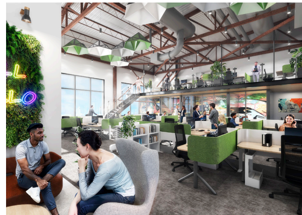
CULTURE – 3,661 SF