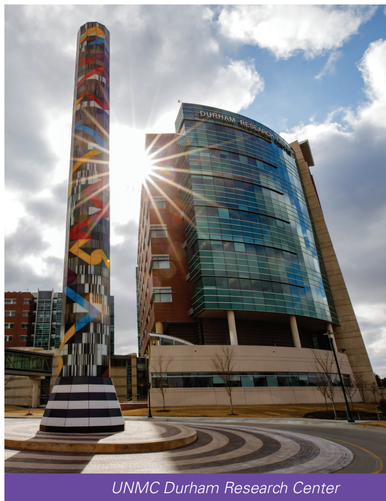
UNMC Durham Research Center

4601 Catalyst Court, Omaha, NE | EDGEomaha.com