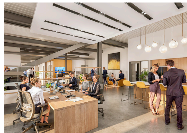
NEURON – 22,082 SF

The above images are conceptual renderings.