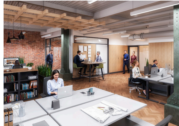
PETRI – 1,824 SF