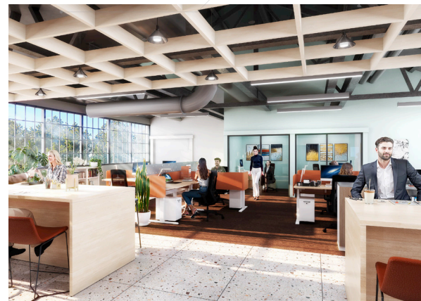
VITALIS – 3,656 SF