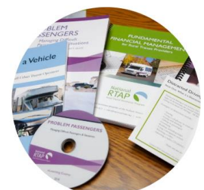
Resource Center Resource Center Assistant Massachusetts