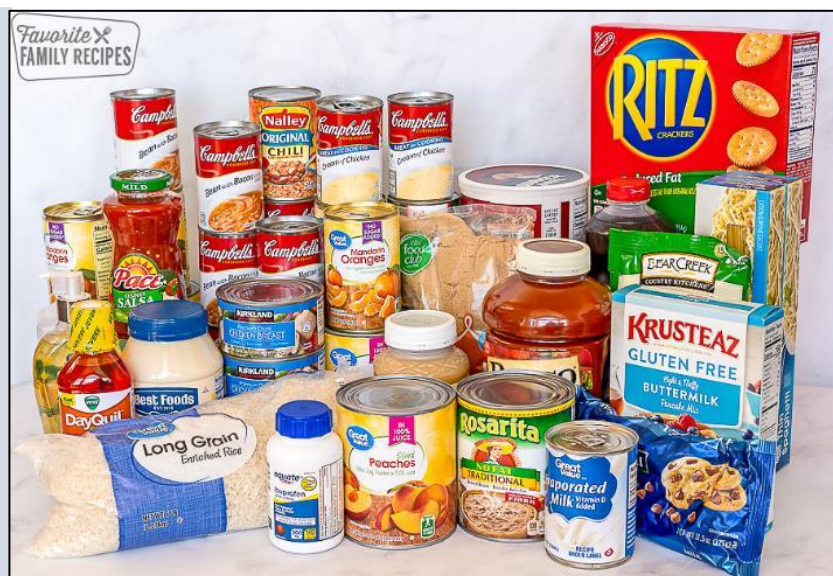
The picture above, shows some good examples of what you could donate for the non-uniform day.

St Vincent de Paul Society helps people in need in our local area by way of food, household items, advocacy and friendship.