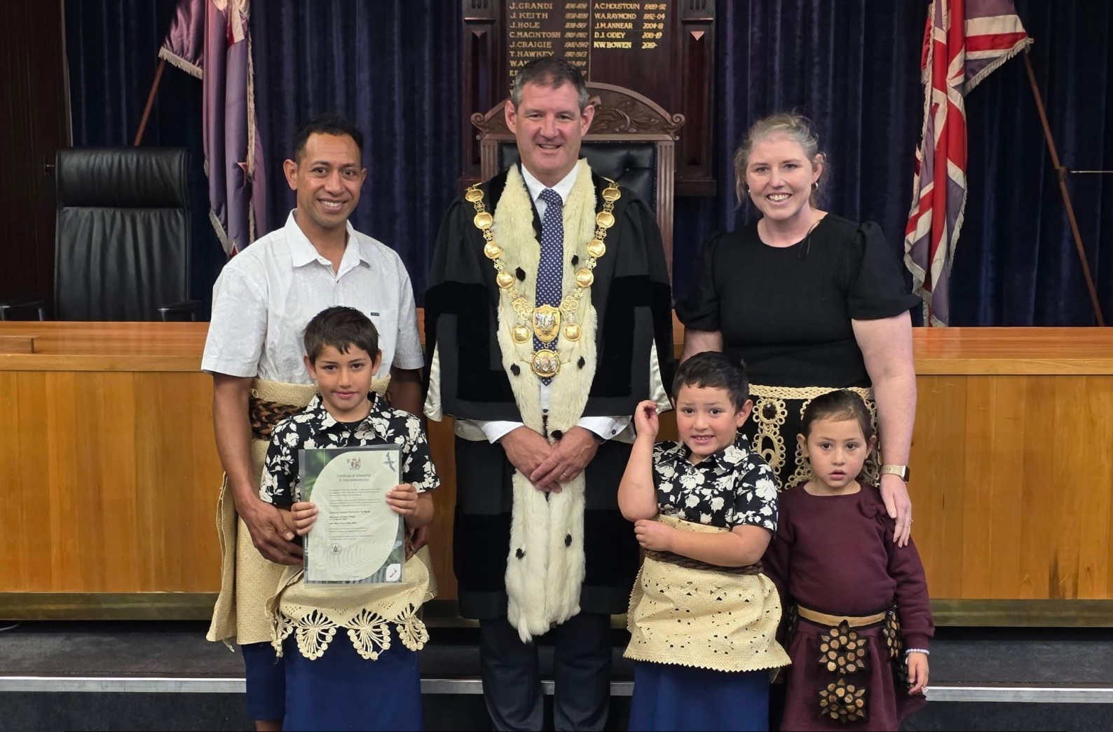
Congratulations to our Sacred Heart Families who were celebrated at the recent Citizenship Ceremony