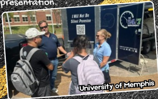
University of Memphis