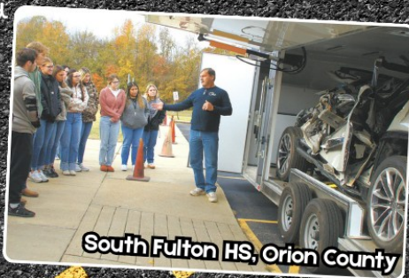
South Fulton HS, Orion County

Our reach continues to expand beyond our region. We were invited to take part in the Drive Safe Campaign at the University of Memphis and to lead assemblies at three high schools in Obion County. Our assemblies blend multimedia, the Dillard SUV, interactive student participation, and the story behind The 24/7 Movement for a powerful presentation.