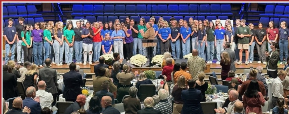
A highlight of the night was recognizing BCHS, CHS & WVHS students and adults who served at the banquet and at school & community safety events.

The organization also highlighted its growing regional impact, reaching thousands of teens through programs that promote safe, responsible driving. It was a night of remembrance, hope, and successful fundraising!