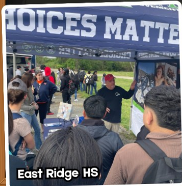
East Ridge HS

Students from 12 high schools across Hamilton, Bradley, Polk, and Rhea Counties participated, including Bradley Central, Cleveland, Walker Valley, Rhea County, and others.