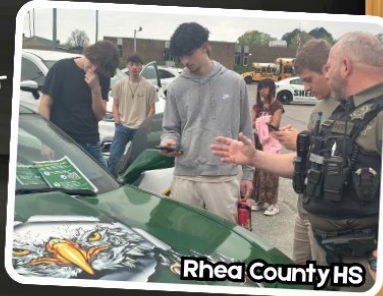
Rhea County HS