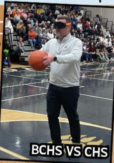
BCHS VS CHS