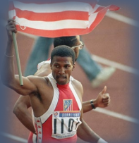
Roger Kingdom, HOF 2X Olympic Gold Medalist