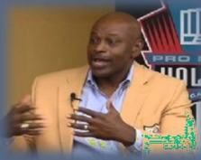
Dwight Stephenson, Pro HOF