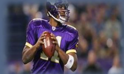
Daunte Culpepper, NFL