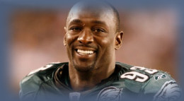
Jevon Kearse, NFL