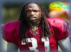
Brandon Meriweather, NFL