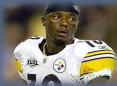
Santonio Holmes, NFL