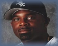
Carl Everett, MLB