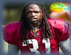
Brandon Meriweather, NFL