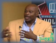
Dwight Stephenson, Pro HOF