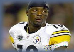
Santonio Holmes, NFL