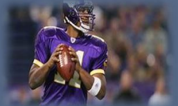
Daunte Culpepper, NFL