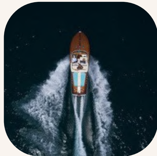
Bardolino & Lazise