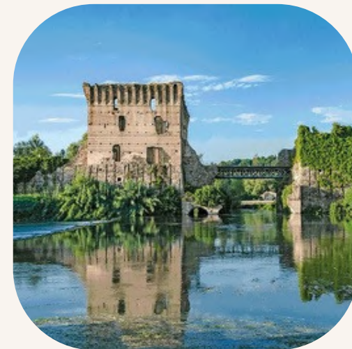
Borghetto sul Mincio & Mantova