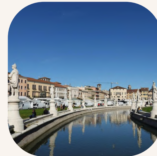
Padova art & food