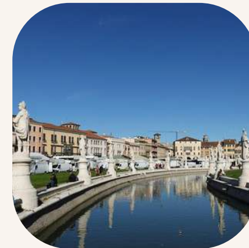
Padova art & food