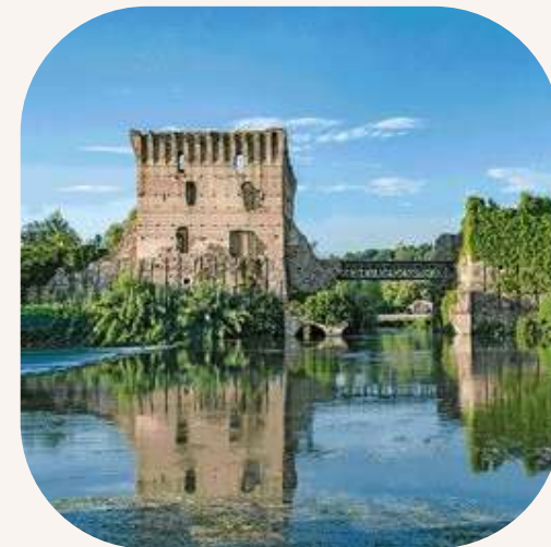
Borghetto sul Mincio & Mantova