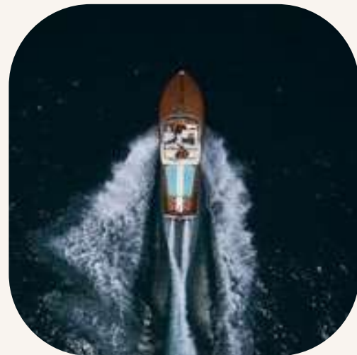
Bardolino & Lazise