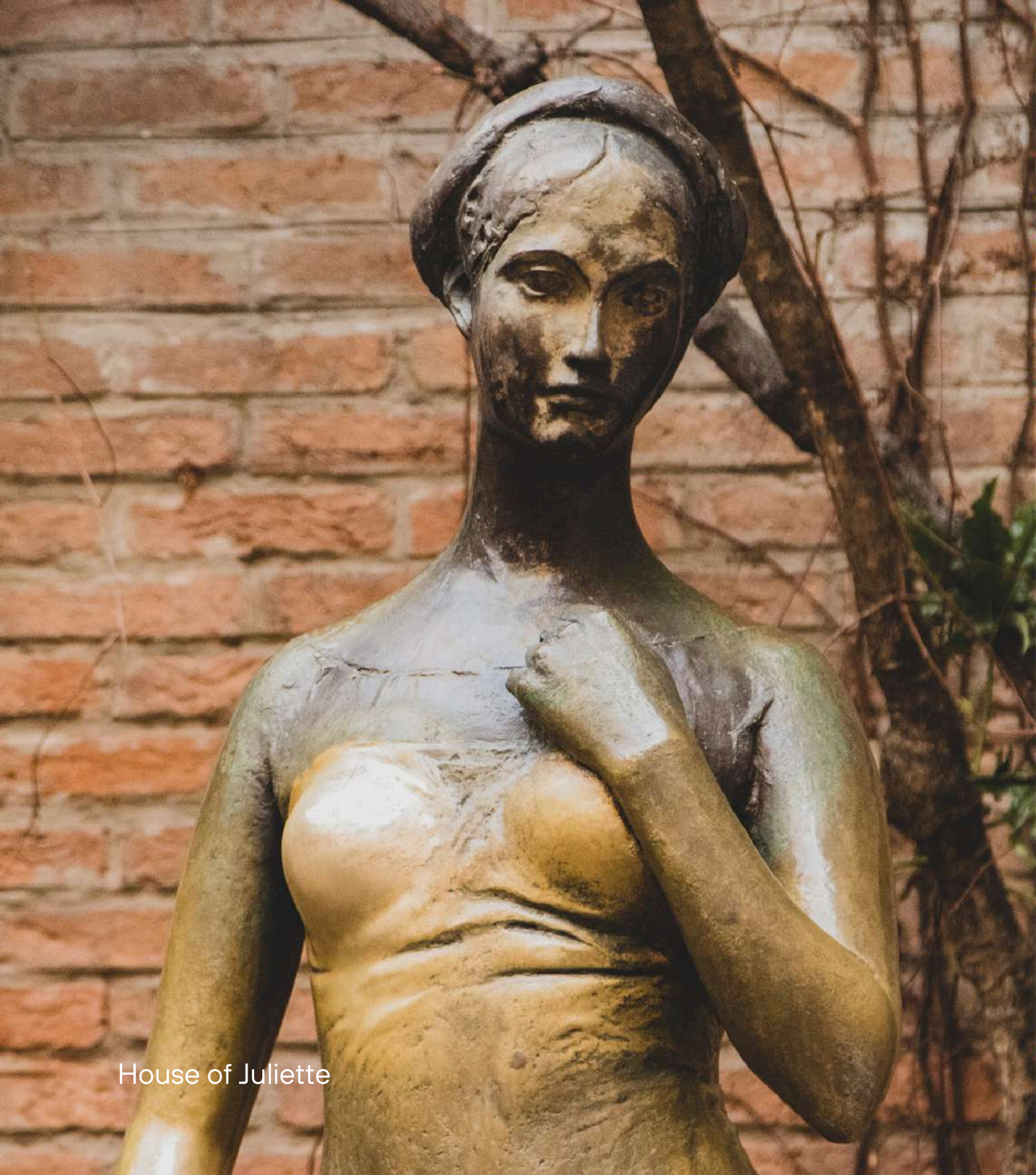
House of Juliette