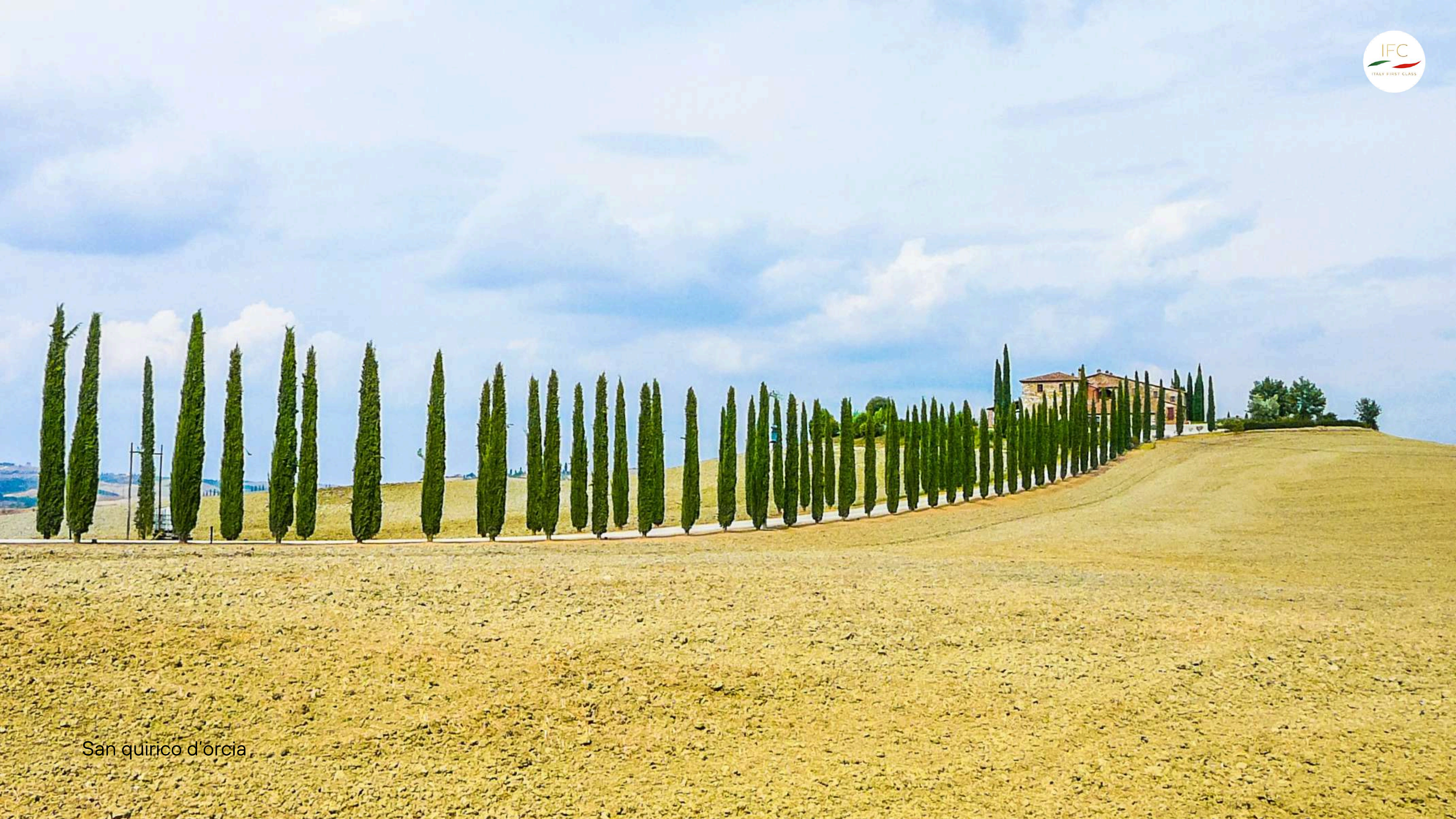
San quirico d'orcìa