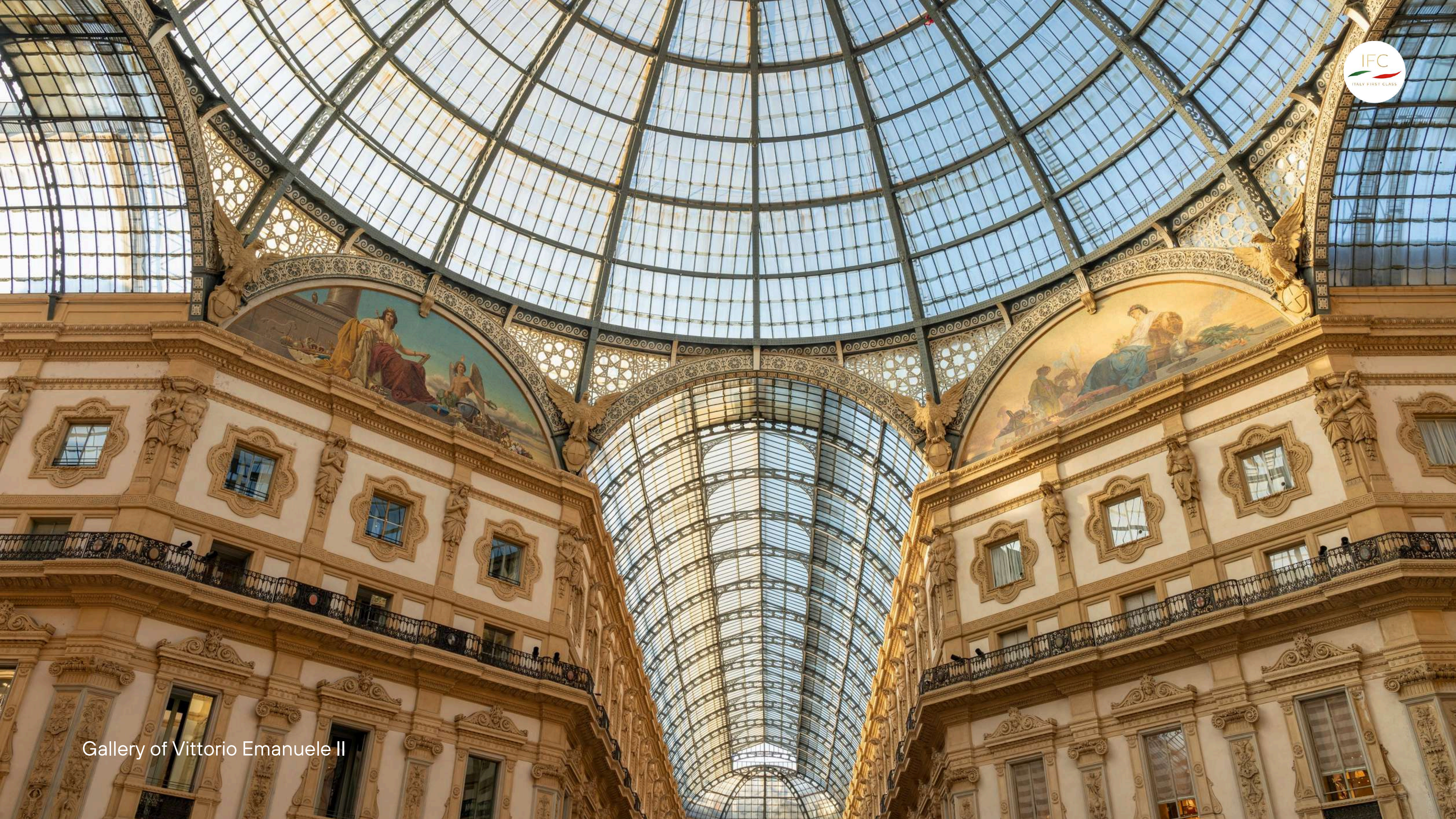
Gallery of Vittorio Emanuele II