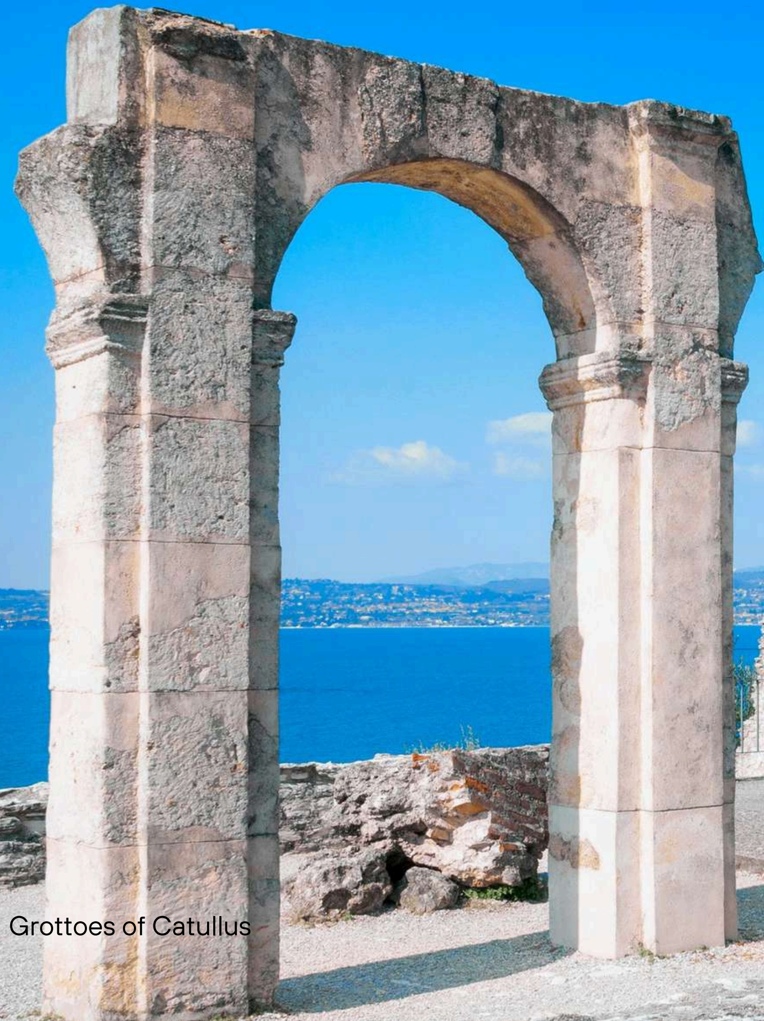
Grottoes of Catullus