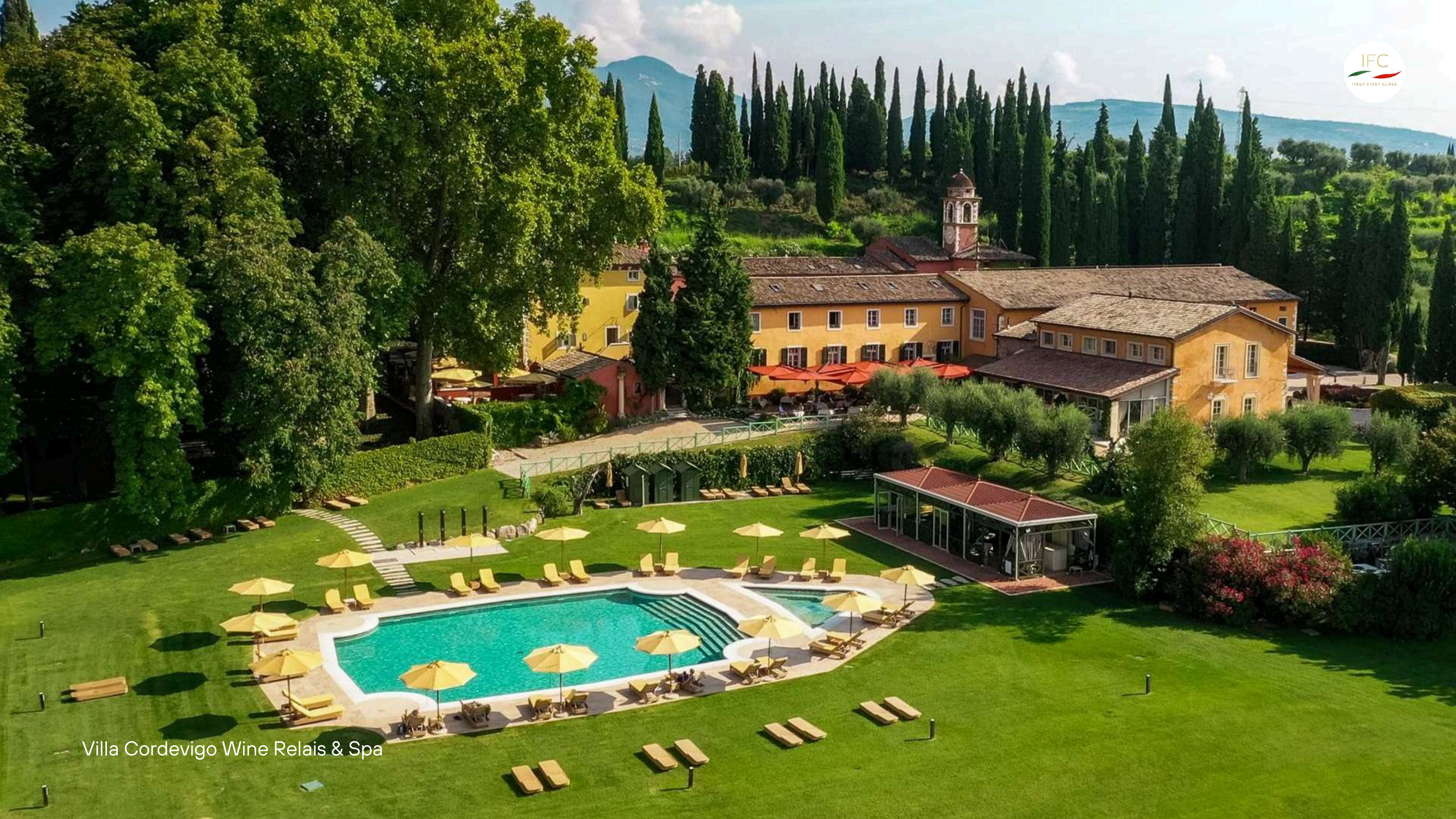
Villa Cordevigo Wine Relais & Spa