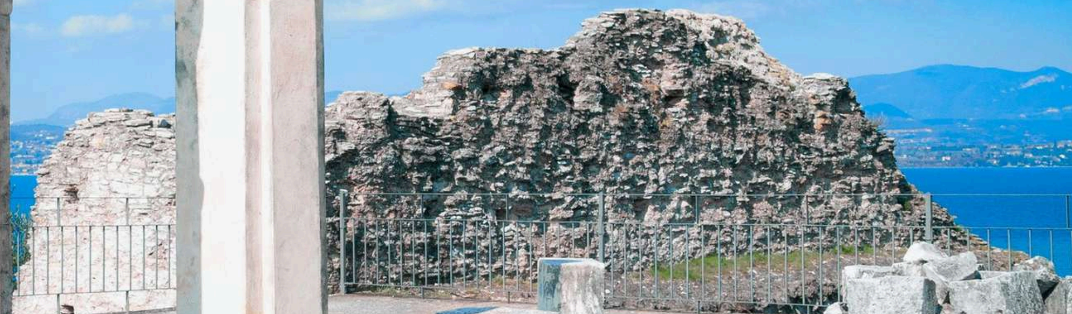
Grottoes of Catullus