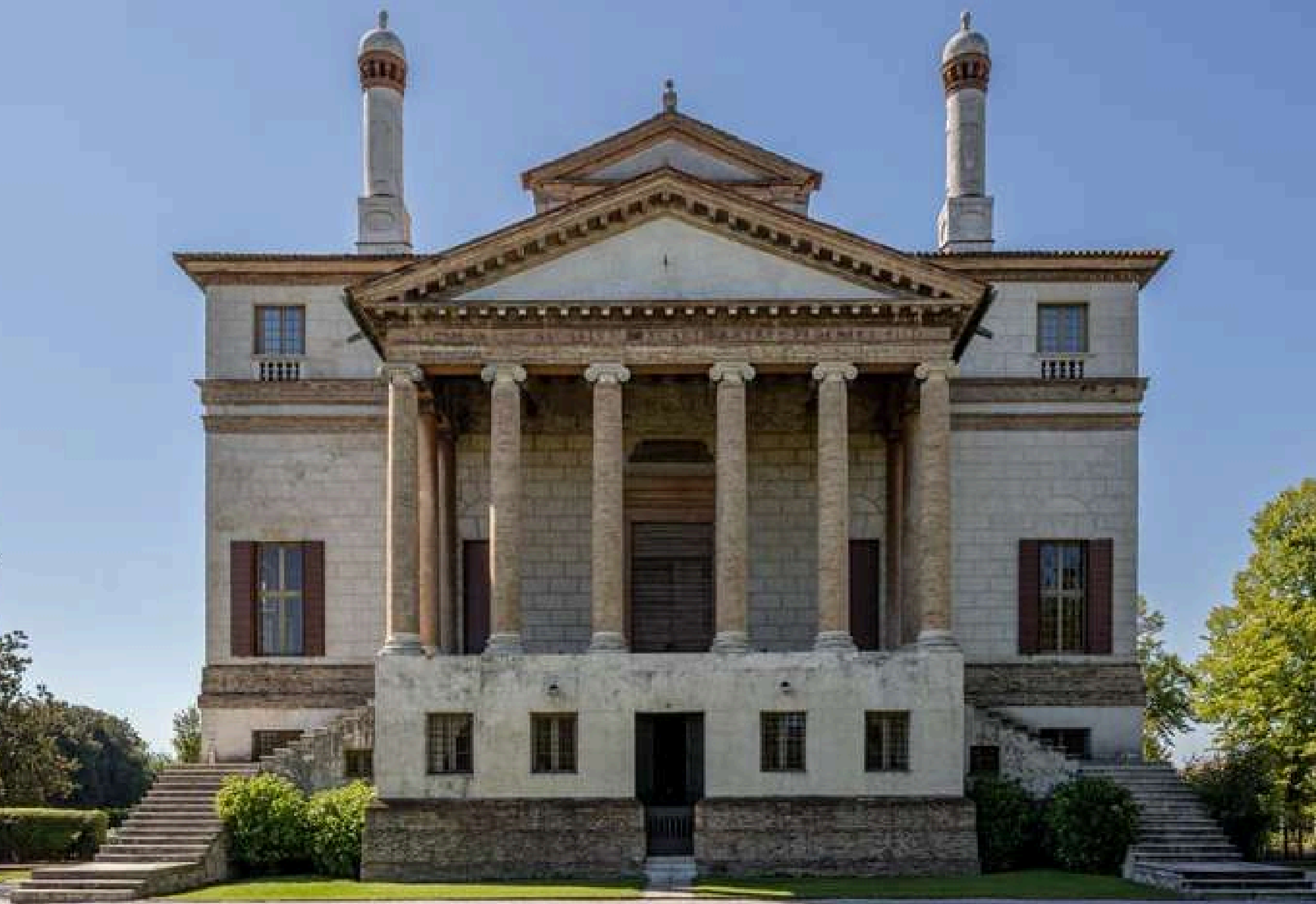
Villa Foscari – La Malcontenta by Andrea Palladio