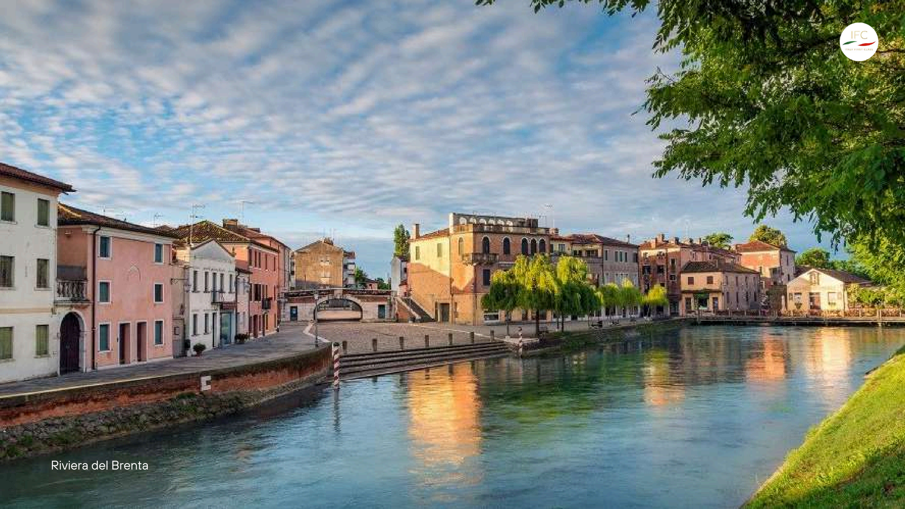
Riviera del Brenta