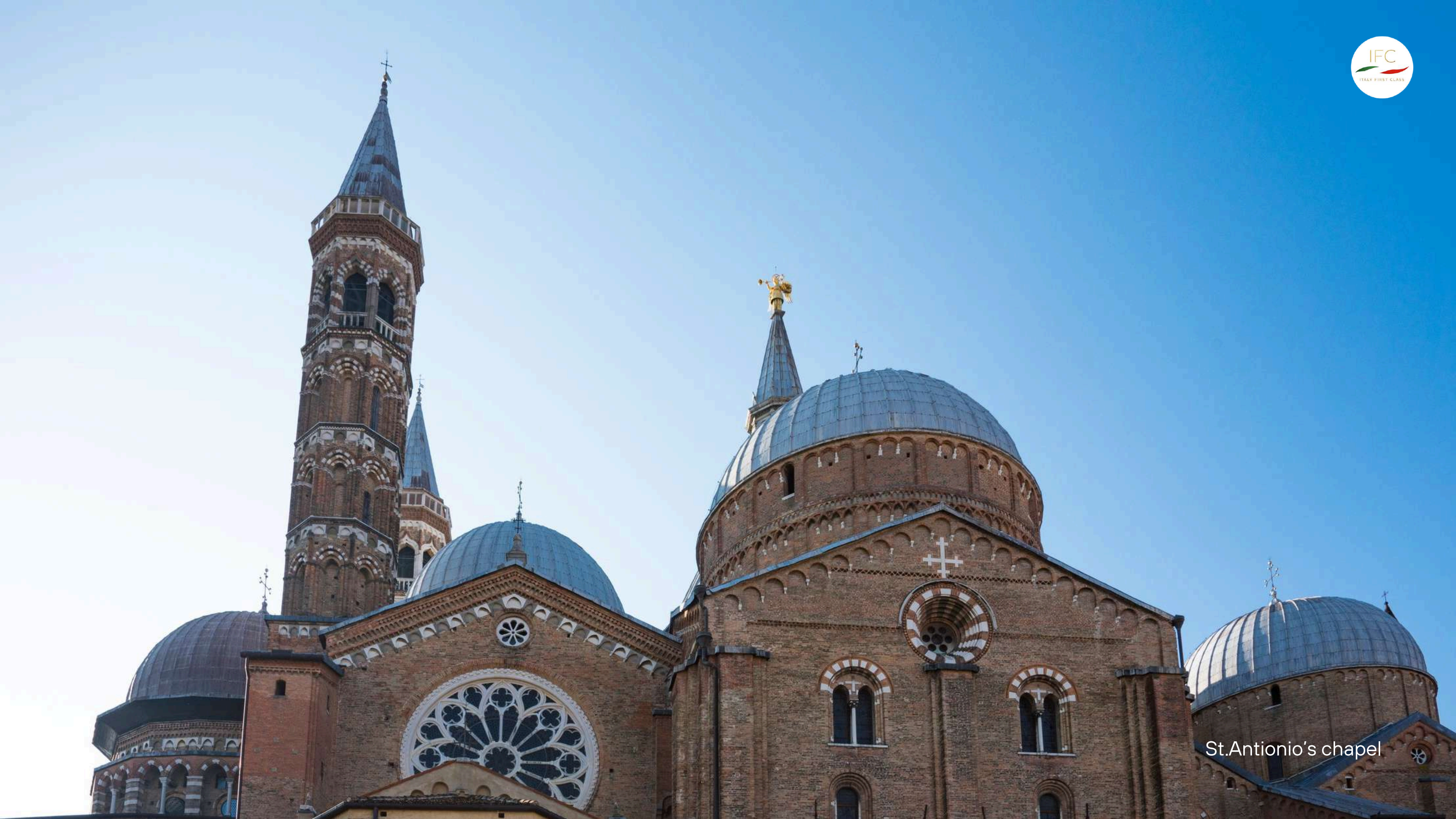
St. Antonio's chapel