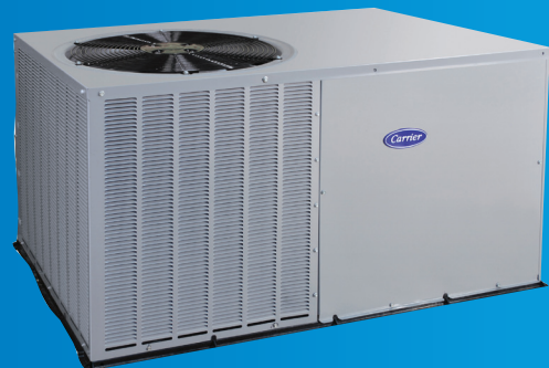
Models 50NP, 50NH