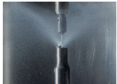
Ultrasonic Atomization of Low Melting Point Alloy and (top left) Gas Atomizer Close Coupled Nozzle

A unique course directed to practitioners and researchers on the principles and practice of powder manufacture by atomization of molten metals