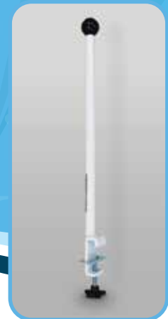
WL1044 & WL1041