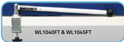
WL1040FT & WL1045FT

Our Bed Sticks are designed to accommodate a wide range of medical beds used throughout the Healthcare industry.