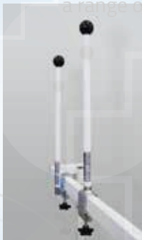
FIXED POLE BEDSTICKS

Deutscher Healthcare design and manufacture a range of accessories for medical beds.