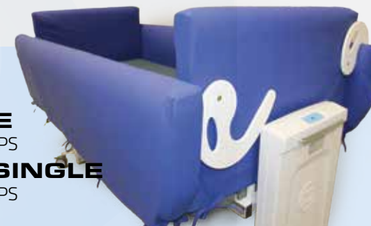
SINGLE WLR1080HPS KING SINGLE WLR1090HPS

High Protection System (HPS) for the Deutscher floorline bed offers maximum safety, protection & comfort.