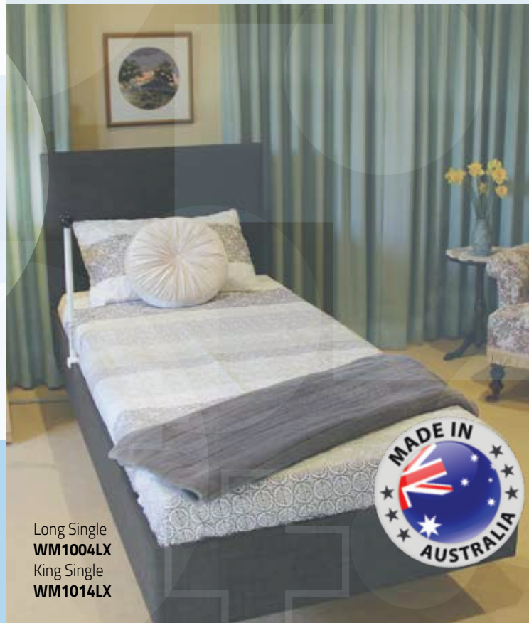
Long Single WM1004LX King Single WM1014LX

The Lexia is available in a variety of different coloured fabrics.