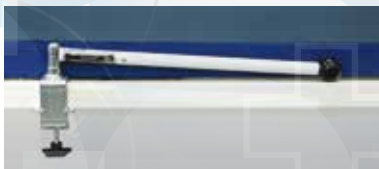
FOLD DOWN POLE BESTICKS