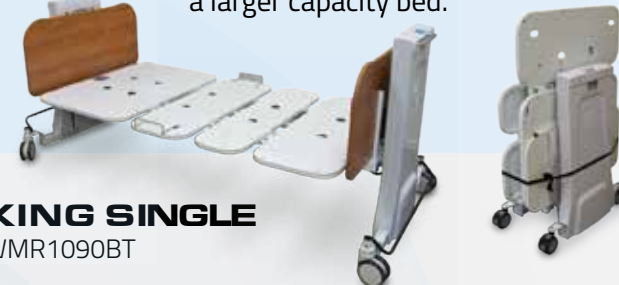
KING SINGLE WMR1090BT

Capacity to care for those who require a larger capacity bed.