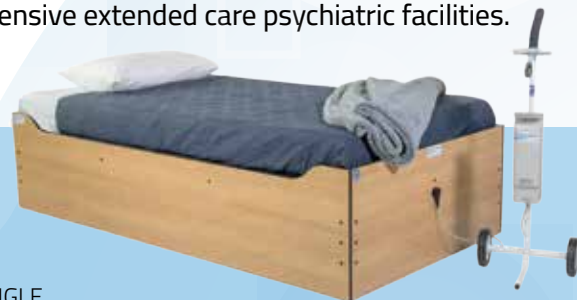
MH BED RANGE

Mental Health Care including use in acute and intensive extended care psychiatric facilities.