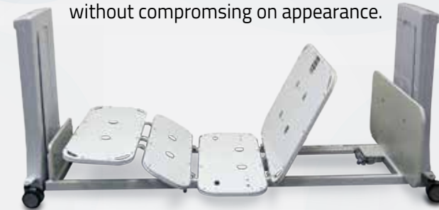
LONG SINGLE BED WMR1080L KING SINGLE BED WMR1090

Slim, floorline bed for ease of function without compromising on appearance.