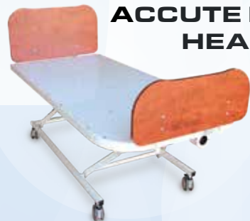
ACCUTE MENTAL HEALTH BED RANGE