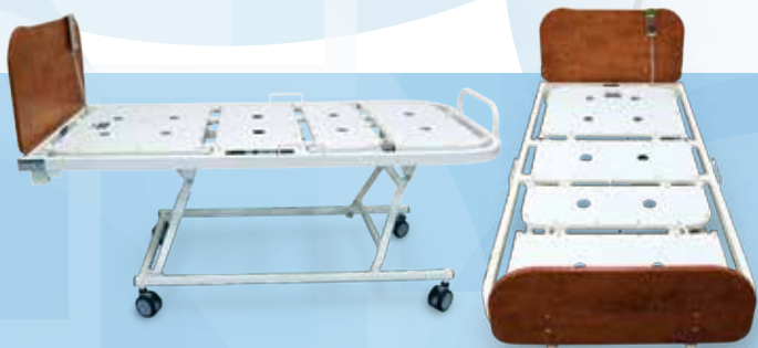
SINGLE BED WM1004

Commercial grade, electrically operated hi-low bed, designed for maximum safety and reliability.