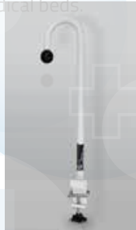
HOOKED TOP BEDSTICKS