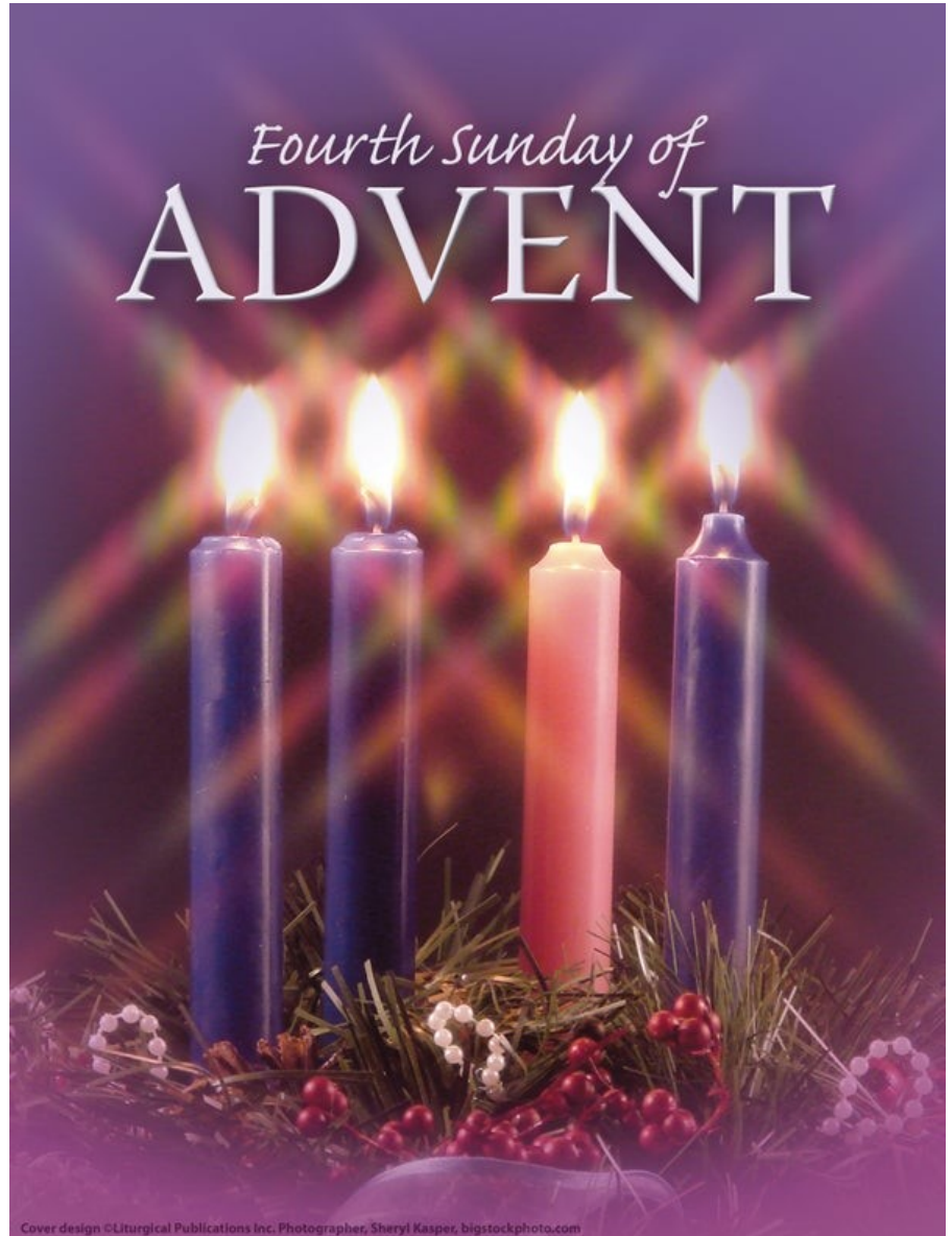
Cover design ©Liturgical Publications Inc.