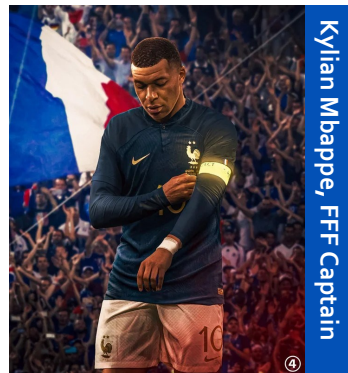
Kylian Mbappe, FFF Captain

We wish the Fédération Française de Football (or Les Bleus) a great run. As they say, Vers la Victoire!