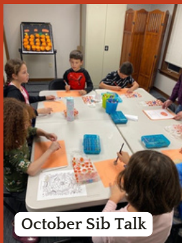
October Sib Talk