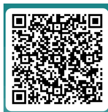
Survey QR Code

The Arc is at the table in the PA system of support for folks with Intellectual Disabilities and Autism to make sure your voice is heard on issues like the staffing crisis, the need for affordable housing, the problem with waiting for services, and more. If you would like to join us as we meet with legislators and state policy personnel to share your stories, drop us a line at info@thearclancleb.org . Legislators need to hear your stories! You can find your legislator's contact information on our Resource page thearclancleb.org/resources under the Miscellaneous tab.