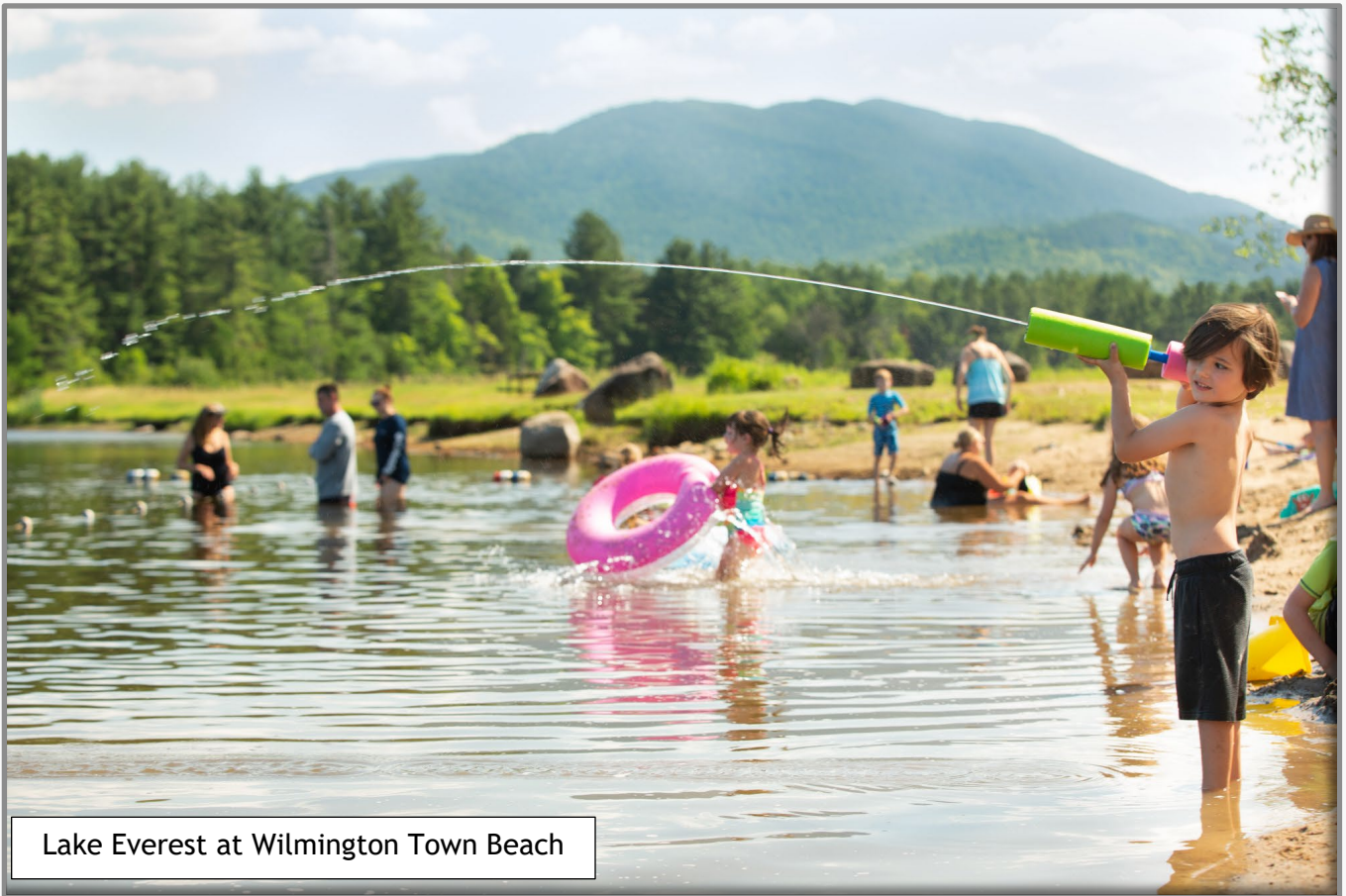
Lake Everest at Wilmington Town Beach