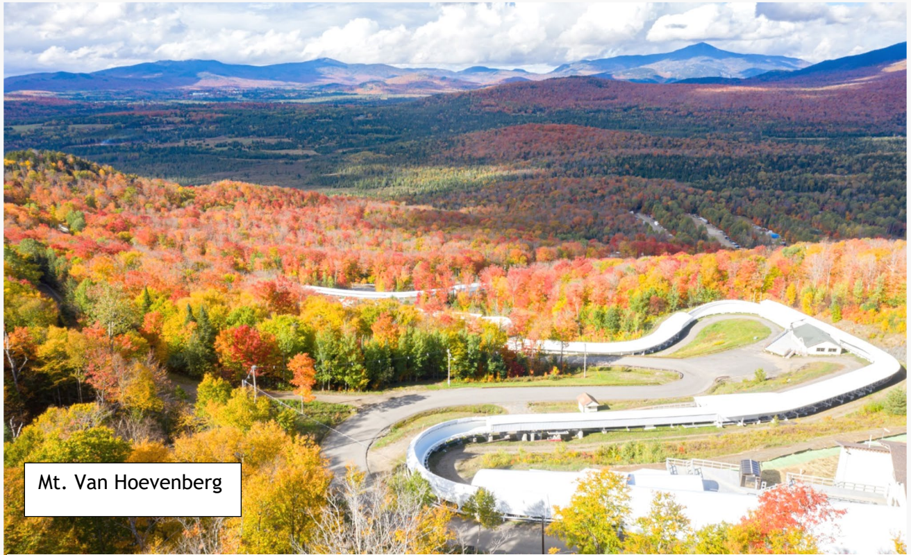
Mt. Van Hoevenberg