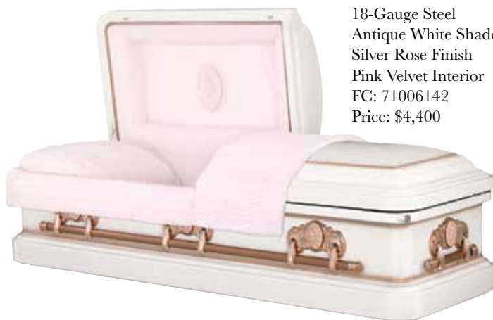
Cameo Rose 18-Gauge Steel Antique White Shaded Silver Rose Finish Pink Velvet Interior FC: 71006142 Price: $4,400