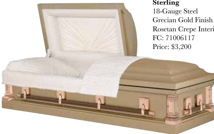
Sterling 18-Gauge Steel Grecian Gold Finish Rosetan Crepe Interior FC: 71006117 Price: $3,200