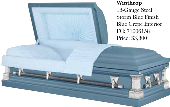
Winthrop 18-Gauge Steel Storm Blue Finish Blue Crepe Interior FC: 71006158 Price: $3,800