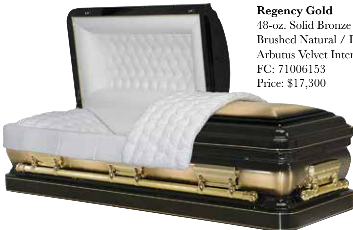
Regency Gold 48-oz. Solid Bronze Brushed Natural / Ebony Finish Arbutus Velvet Interior FC: 71006153 Price: $17,300