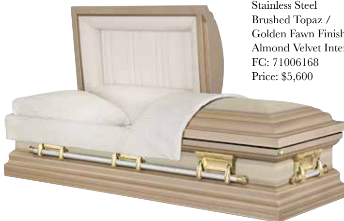
Newport Stainless Steel Brushed Topaz / Golden Fawn Finish Almond Velvet Interior FC: 71006168 Price: $5,600