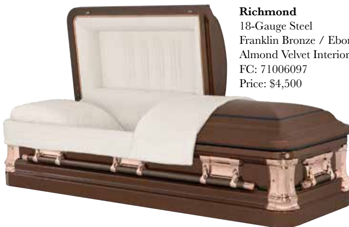
Richmond 18-Gauge Steel Franklin Bronze / Ebony Finish Almond Velvet Interior FC: 71006097 Price: $4,500