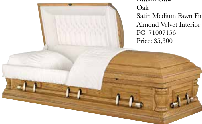
Ratlin Oak Oak Satin Medium Fawn Finish Almond Velvet Interior FC: 71007156 Price: $5,300