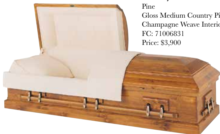
Country Pine Pine Gloss Medium Country Pine Finish Champagne Weave Interior FC: 71006831 Price: $3,900