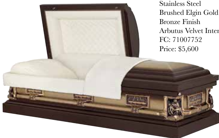
Pieta Stainless Steel Brushed Elgin Gold / Metallic Bronze Finish Arbutus Velvet Interior FC: 71007752 Price: $5,600