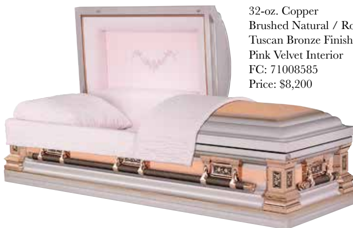
Victoria 32-oz. Copper Brushed Natural / Rosebud / Tuscan Bronze Finish Pink Velvet Interior FC: 71008585 Price: $8,200