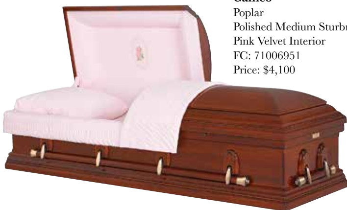
Cameo Poplar Polished Medium Sturbridge Finish Pink Velvet Interior FC: 71006951 Price: $4,100