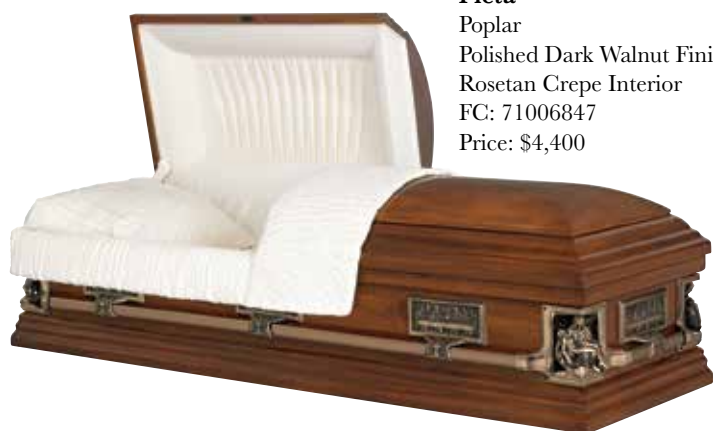
Pieta Poplar Polished Dark Walnut Finish Rosetan Crepe Interior FC: 71006847 Price: $4,400