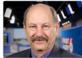
SEE PAGE 2