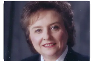
SEE PAGE 3