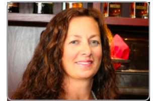
SEE PAGE 3