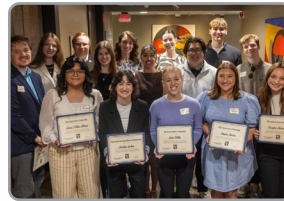
SEE PAGE 2

VOLUME 149 • NUMBER 101 MAY 2026 WWW.OMAHAPRESSCLUB.COM