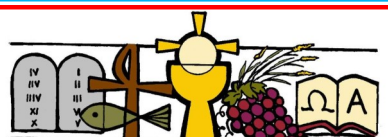
The Solemnity of the Most Holy Body & Blood of Christ

This is the mystery that is at the heart of our Eucharistic theology. In the elements of bread and wine, Jesus' Body and Blood are truly present. When we share in the Body and Blood of Christ, Jesus himself comes to dwell within us. This communion with the Lord makes us one body, brings us eternal life, and sends us forth to be Christ's Body in the world.