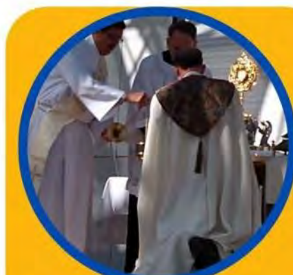
Adoración del Santísimo Sacramento

Se brindarán Rosarios, Sillas, Agua, Baños, Seguridad, Asistencia Médica.