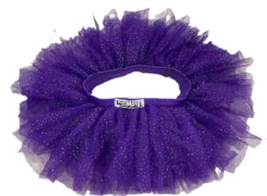
Ready Set Move Skirt (Optional)