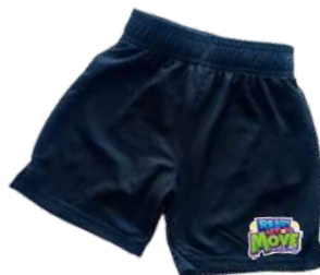
Ready Set Move Shorts (Optional)