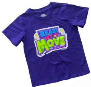
Ready Set Move Tee (Compulsory)