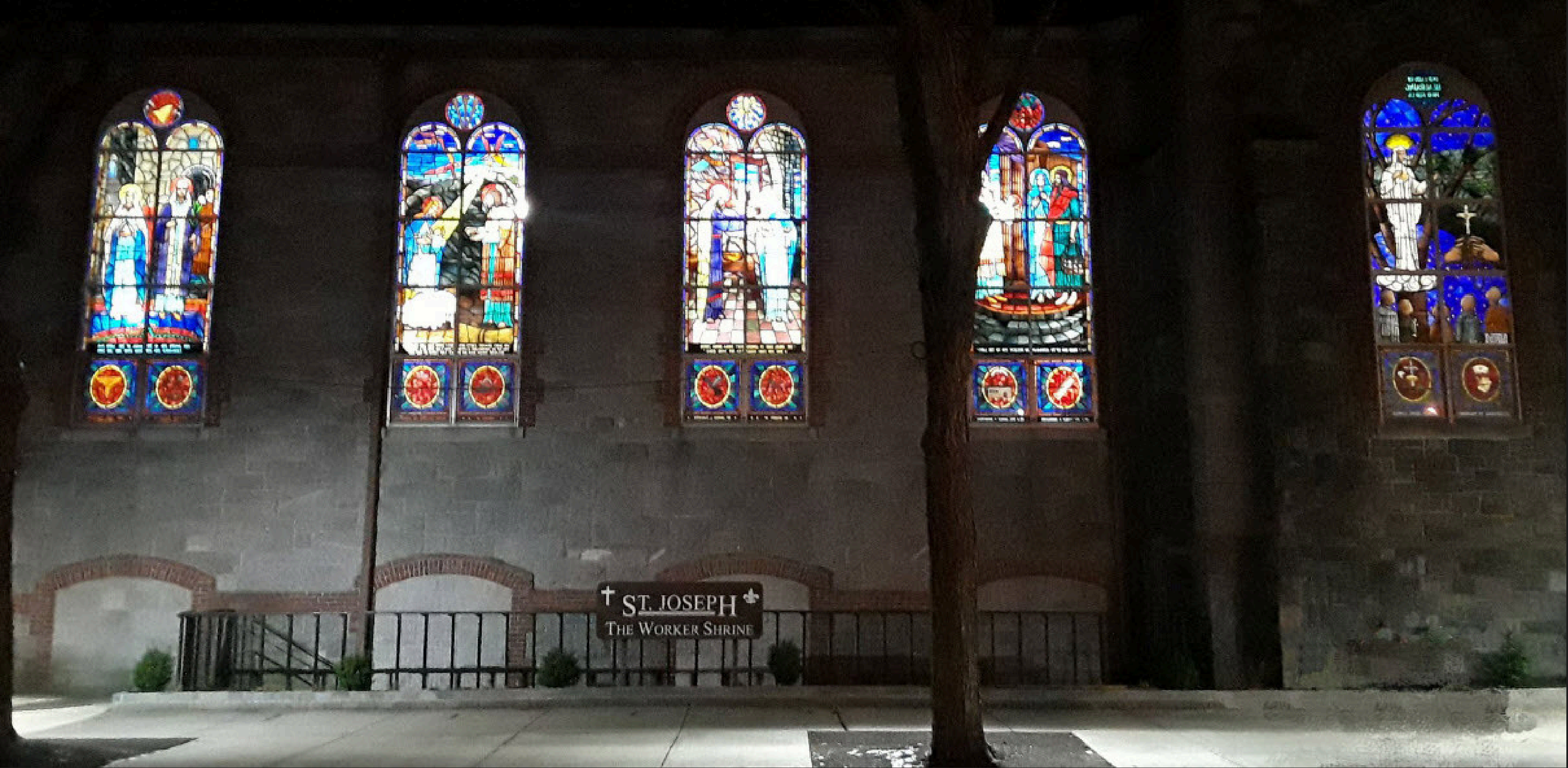
Praying with the Windows of St. Joseph the Worker Shrine