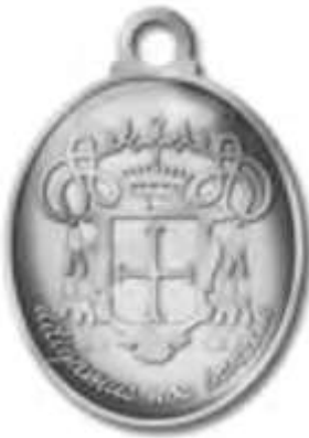
Cheverus Award Medal