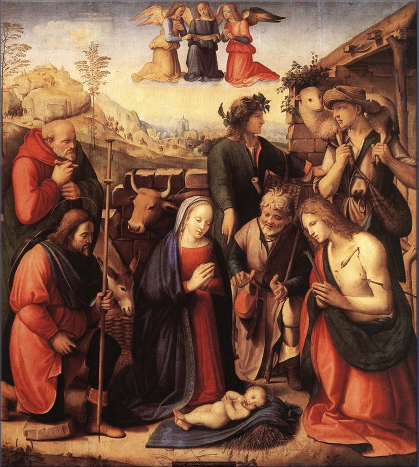
Adoration of the Shepherds Ridolfo Ghirlandaio 1510