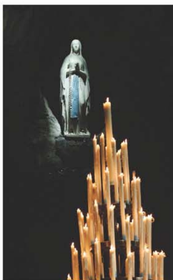
Candles burn in front of the statue of Mary at the grotto at the Shrine of Our Lady of Lourdes in southwestern France.

St. Bernadette's accounts of seeing a heavenly vision of