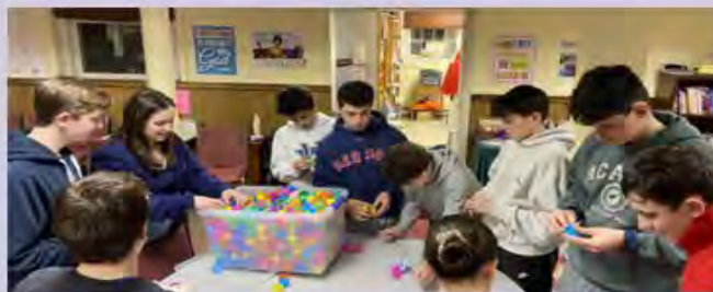
The egg hunt was a hit as always!

"COME HOLY SPIRIT" (G6-8) After their lesson the students finished up their last week of classes by filling Easter eggs for our annual Easter Egg Hunt after the 9:30AM Mass. It was a wonderful way for the students to join together, giving back to the younger members of our church community.